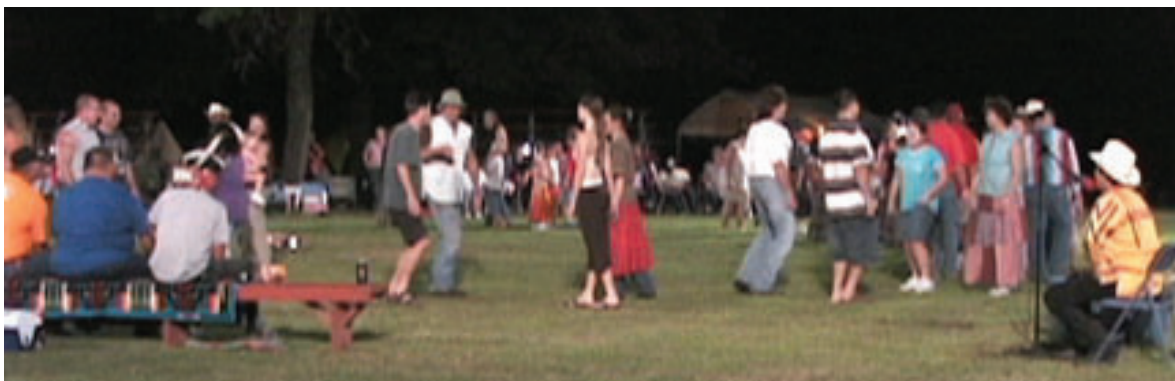
Duck Dance at Delaware Days