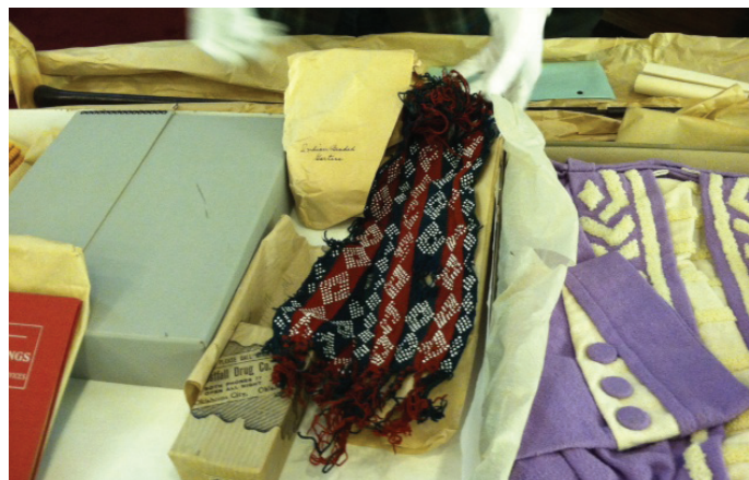
One of the items found in the 100-year "Century Chest" time capsule opened at the First Lutheran Church in Oklahoma City on April 21 was this beaded garter.