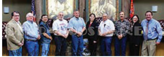
Members of the Delaware Tribe traveled from Oklahoma to gain insight on the Confederated Salish and Kootenai tribal operations.

The Delaware, or as they were traditionally known “Lenape,” were among the first tribes to come in contact with Europeans in the 1600s. Forcefully relocated westward from their aboriginal territory along the Delaware River, the tribe’s historical relationship with the US Government is strained with war and resistance. The Delaware have received and lost federal recognition three times.