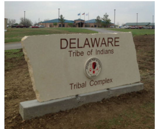
New sign in front of Bartlesville campus, made of natural stone.

On May 9 we had a meeting with the Cherokee on the Aid-to-