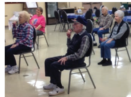
Elder chair exercise program is held three times weekly in the Dining Hall.

Please note that there is no medical staff on duty so use equipment at your own risk. ■