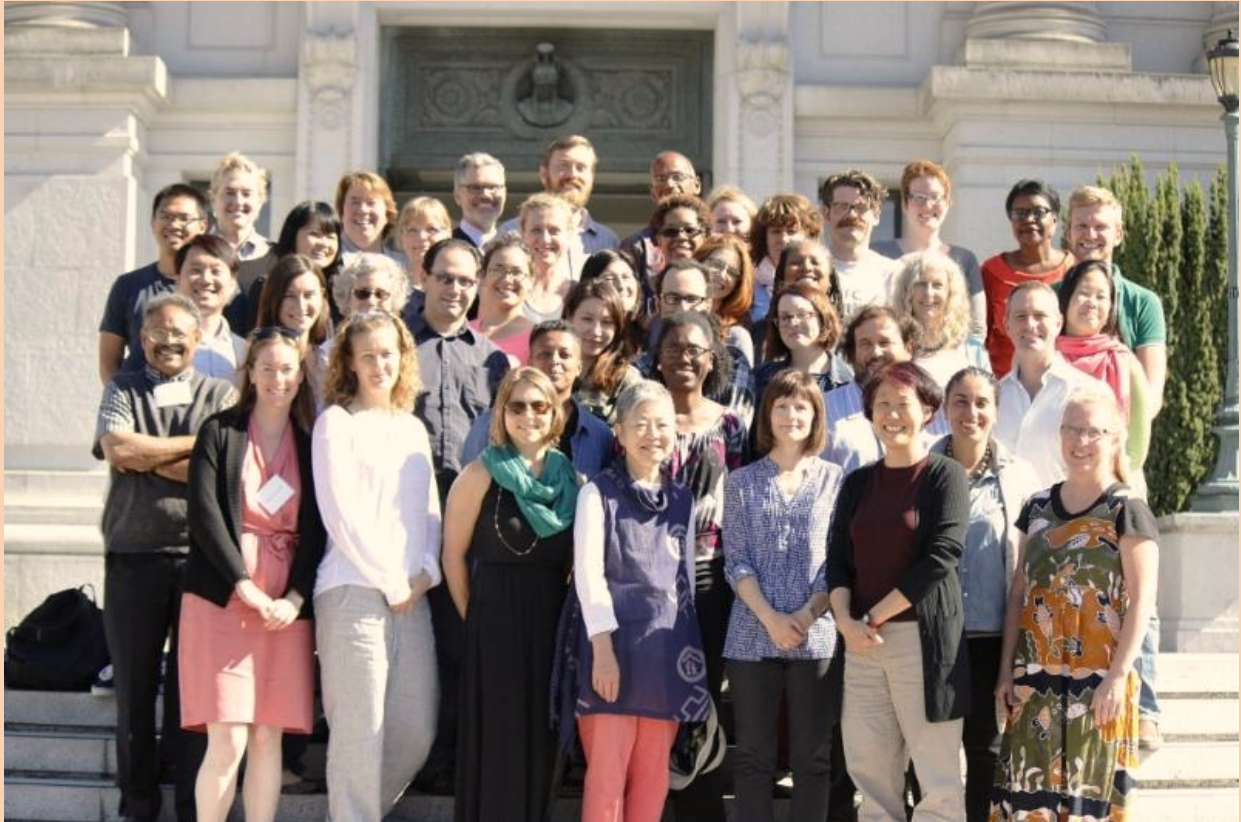
Participants and Faculty of the 2014 Advanced Oral History Summer Institute

organized through the lens of the "life cycle of the interview" and we covered topics like method, theory, legal and ethical issues, project planning, the art of the interview, project funding, and presentation. [ Read more ]