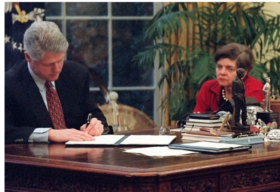
Alice Rivlin, then OMB director, with President Clinton.