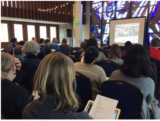
A packed house at our annual Spring Introduction to Oral History Workshop

We are thrilled to continue to offer our expanded educational programs through our one-day introductory workshop. On February 25, 2017, the OHC hosted our third annual Spring Workshop at the MLK Student Union. Designed for anyone interested in learning more about how to bring oral history to their work, the workshop provides participants with the tools to plan their own oral history projects,