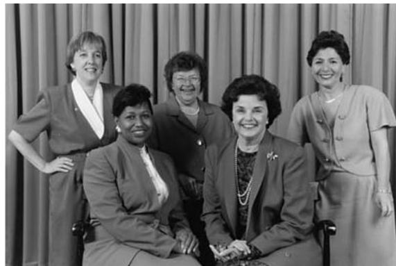
Women newly elected to the US Senate in 1992

The year 2017 is certainly off to a tumultuous start with the words uncertainty, acrimony, and conflict in regular circulation throughout the body politic. As such, there is good reason that so many of us are glued to our news feeds, anxiously awaiting what sensation story might come next. But there is also good reason, I think, to step back from the flurry of 'the now' and retreat a bit into the past. I've never been one to accept the notion that by studying history we can inoculate ourselves from repeating the mistakes of the past. I think that the present is not only a different time, but also a different place, so we would be asking too much of history to play such a preventative role. Still, as a historian, I am convinced that knowledge of the past can help us better understand the present and perhaps suggest a range of options... [ read more ]