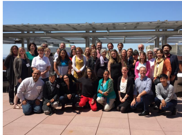
Participants in our 14th annual Advanced Oral History Summer Institute, held this past August at the MLK Student Union on the Berkeley campus