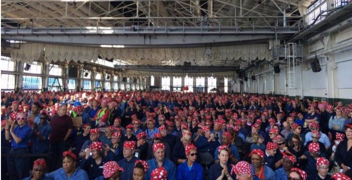
Rosie Rally August 13, 2016, Richmond Craneway Pavillion, 2,229 strong Guinness World Record for Most People Dressed as Rosie the Riveter in one place.

When I joined the Oral History Center in 2002, we had just begun our collaboration with the National Park Service on the Rosie the Riveter / World War II Home Front Oral History Project. The initial phase of the project called for sixty interviews to document Richmond and the Bay Area during the home front period. I was an interviewer, transcriber, videographer, editor, and web producer. Fourteen years later we have completed over 250 oral histories with women and men about this unique time period in United States history, making this our largest single community oral history project. [ Read more ]