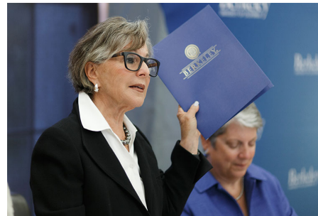
Senator Barbara Boxer, with UC President Napolitano, at the Bancroft Library