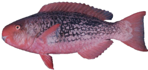
Uhu pālupaluka Scarus rubroviolaceus Redlip parrotfish (initial-phase)