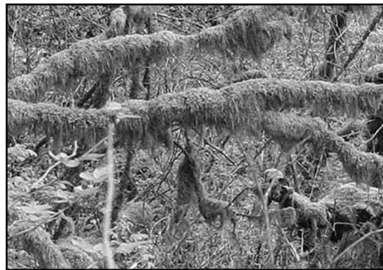
Moss growing on horizontal branches may be harvested at a rate of 10%, as in the example photograph above.