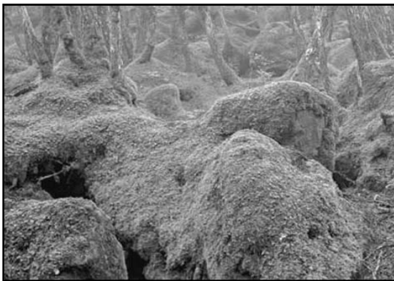
Moss growing on steeply sloped surfaces, as in most of the above example photograph, should not be harvested.