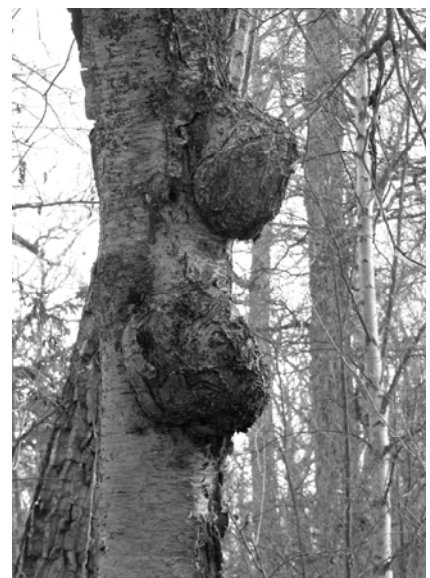
Birch with multiple burls