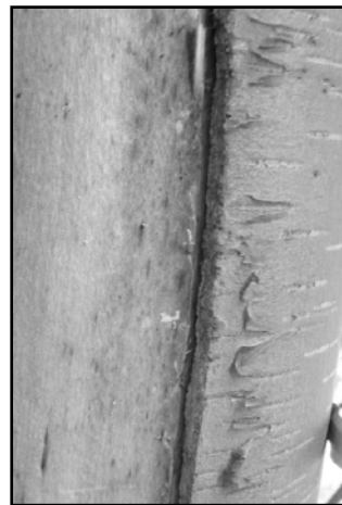
Fatally damaged tree as a result of an incision made too deeply and subsequent removal of inner bark, exposing bare wood.