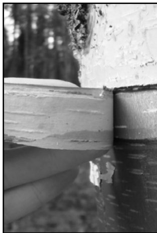
The outer park peels readily from the inner bark in the spring during sap flow. Do not force bark removal as it may damage the inner bark.