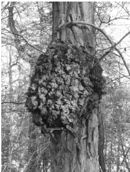
Mature cottonwood with large burl