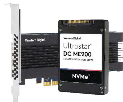
Ultrastar DC ME200 Memory Extension Drive, NVMe™ 2.5-inch U.2 and AIC HH-HL form factors