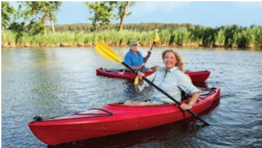
Outdoor Adventure: Enjoy birdwatching, cycling, hiking and paddling throughout the county and at the 28,000-acre Blackwater National Wildlife Refuge.