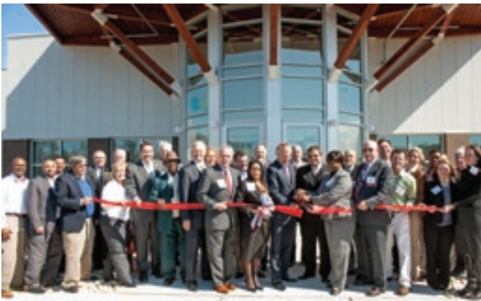
The Eastern Shore Innovation Center, the Tech Park's anchor tenant, opened in 2016.

* January 2017 Farm Market Value Assessment, W.R. McCain Associates