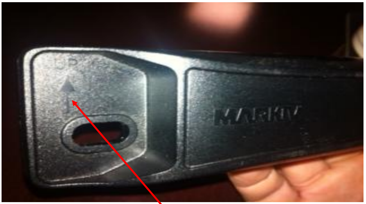
Orientation Arrow (Pointing Skyward)