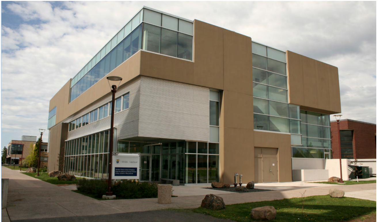
Northern Ontario School of Medicine at Lakehead University

Though remuneration incentives can help to financially equalize specialties, encouraging students to choose psychiatry goes beyond remuneration – students also want to choose a specialty that is personally and professionally rewarding. Unfortunately, the field of psychiatry is wrought with stigma and misconceptions of the practice being at best, unfulfilling or at worst, unsafe. 31 Addressing these misconceptions is essential to improving medical students' attitudes about the profession. Furthermore, emphasizing the rewarding aspects of the profession – including meeting the clinical needs of a vulnerable population, and the uniquely interdisciplinary nature of the profession – can help to attract more talent to the profession.