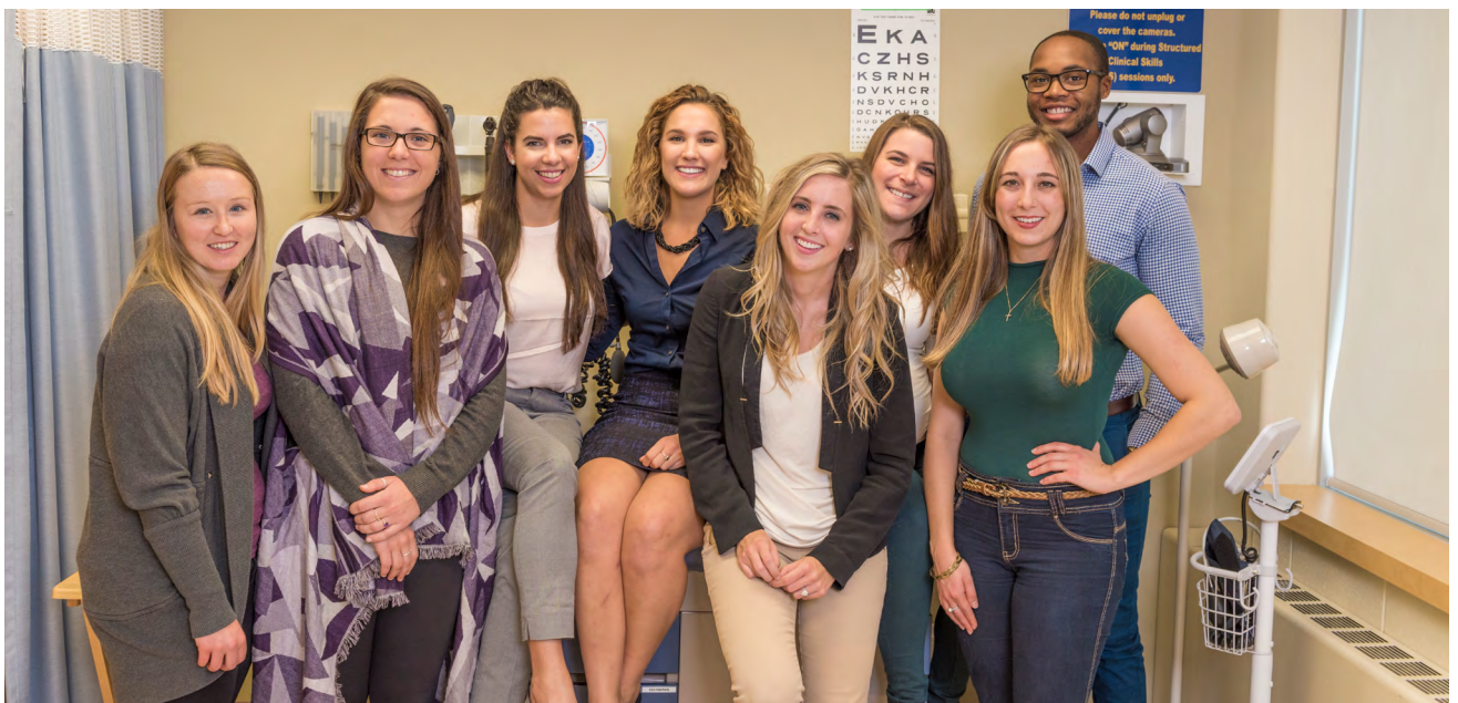
Northern Ontario School of Medicine students

It is clear that enhancing and maintaining a robust pre-clerkship program in Canadian medical schools is vital to recruit new talent to psychiatry. Investing in this experience improves attitudes about psychiatry and attracts medical students to the profession.