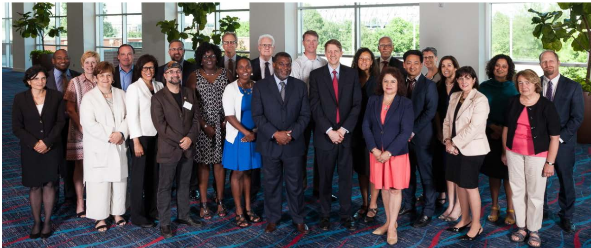
Members of the Consumer Advisory Board and CFPB staff pose for a group photo with Director Cordray before the June 2016 meeting in Little Rock, Arkansas.

Detailed summaries of the above topics discussed during full Board meetings can be found at consumerfinance.gov/advisorygroups .