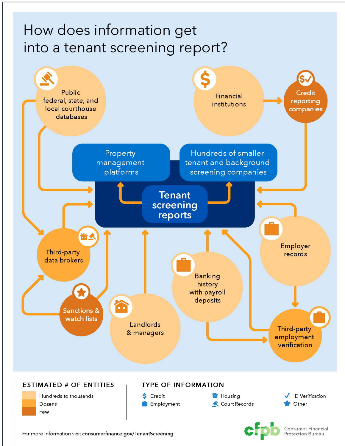
FIGURE 4: TENANT SCREENING ECOSYSTEM: HOW DOES INFORMATION GET INTO A TENANT SCREENING REPORT?