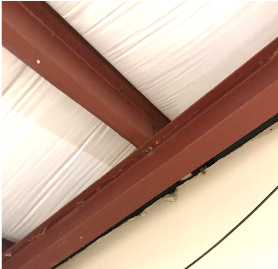
Figure 1-8. New Roof Structure