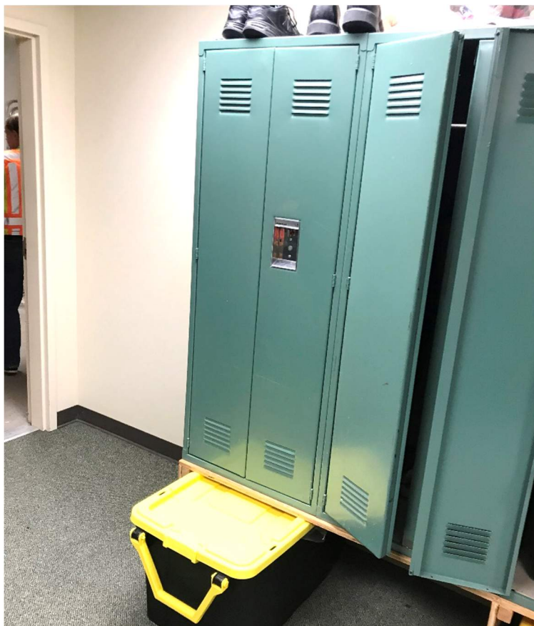
Figure 1-6. Interior Contents Unattached