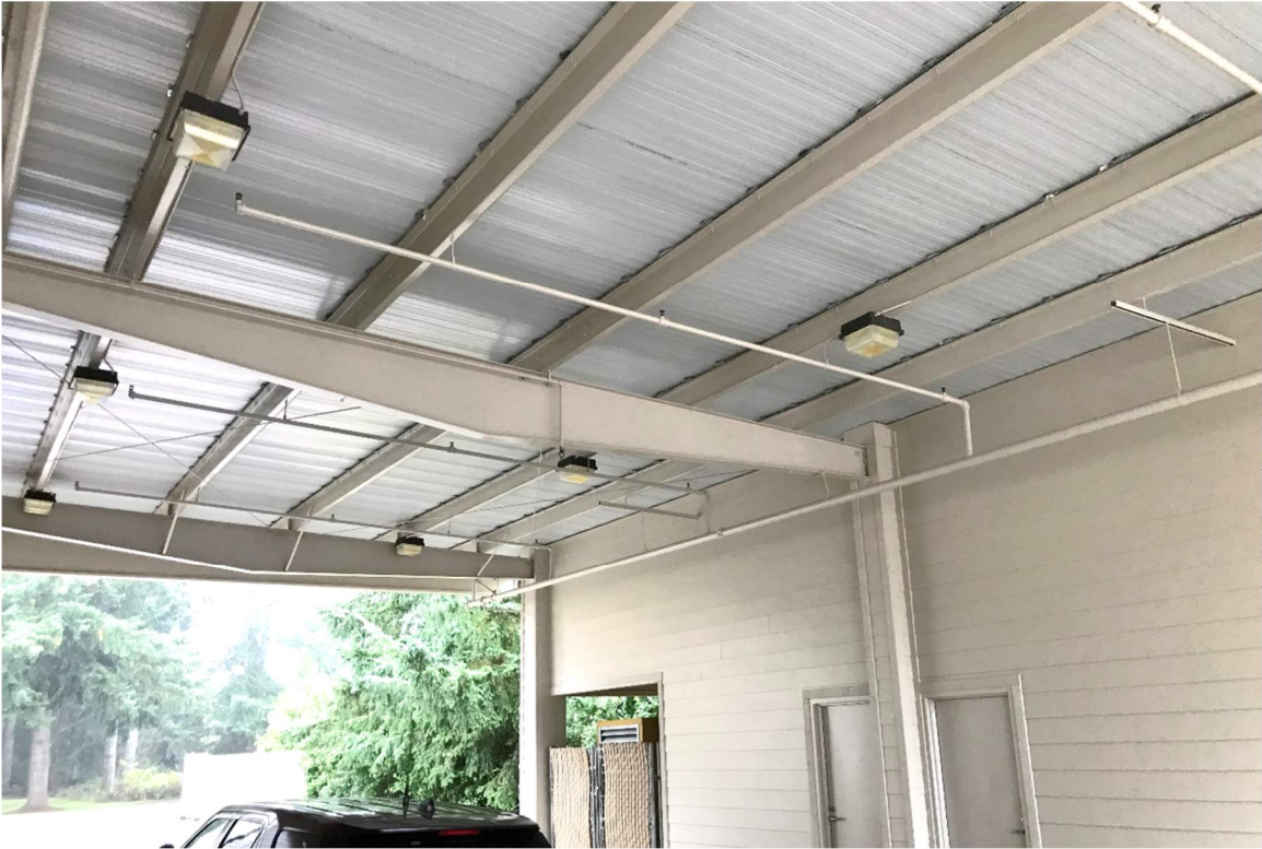
Figure 1-7. Truck Washing Bay Structure