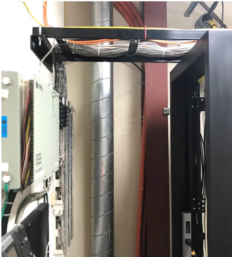
Figure 1-5. IT Equipment Secured