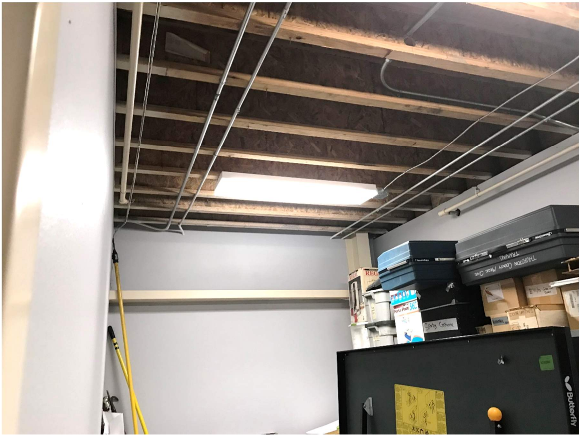
Figure 1-3. Structure of Second Floor