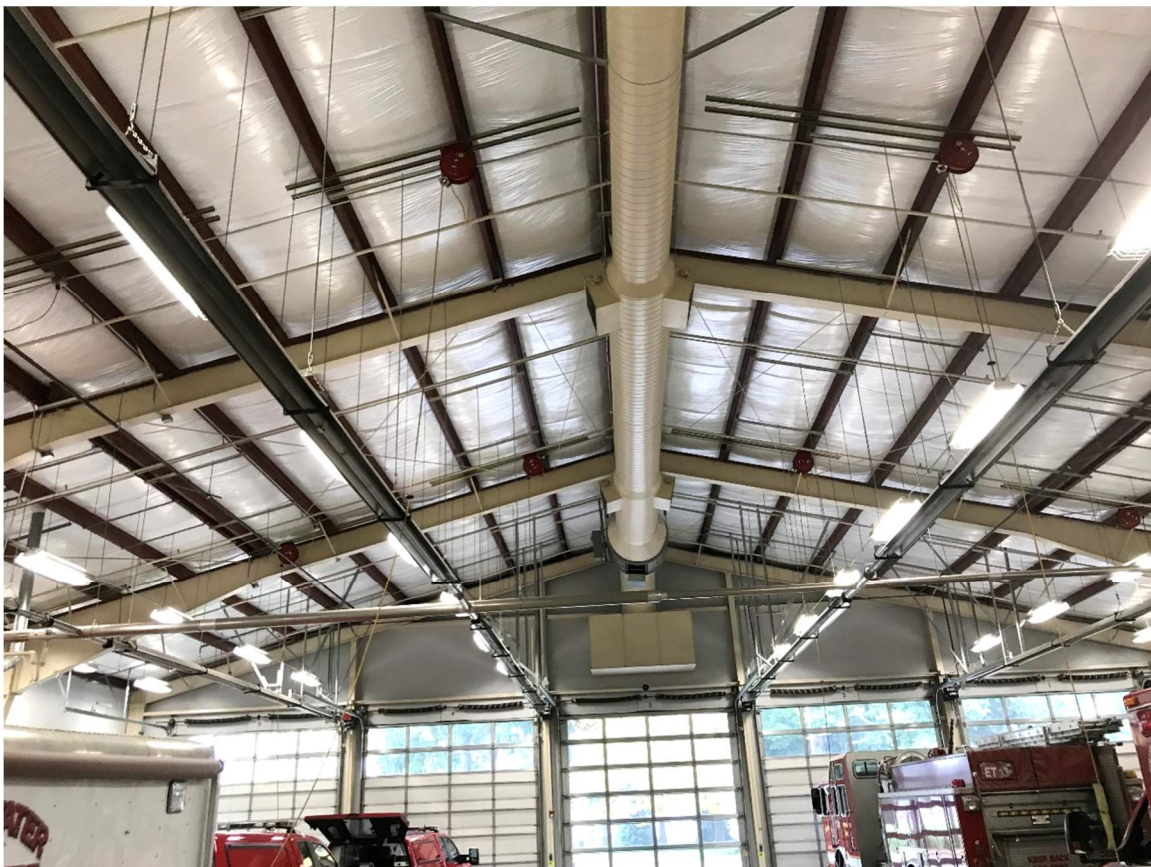
Figure 1-2. Structure of Vehicle Bay