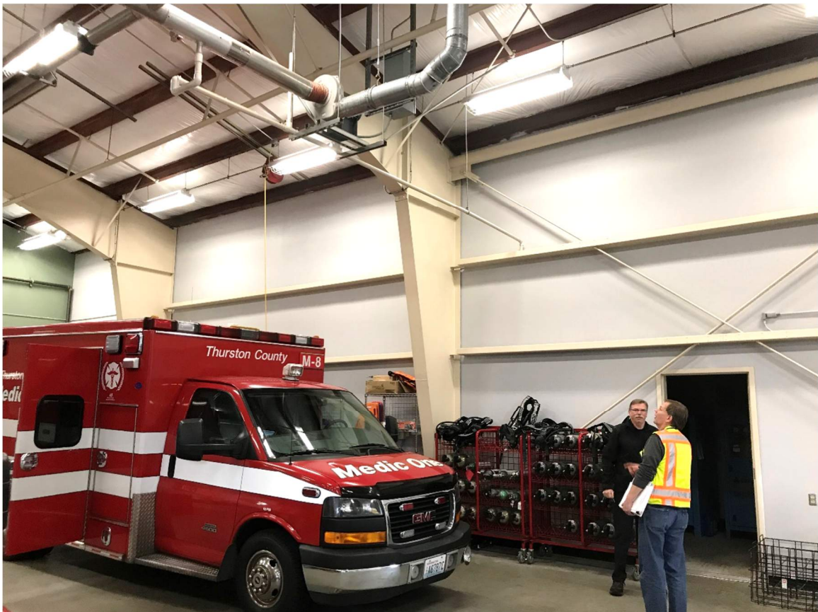
Figure 1-4. Vehicle Bay Bracing