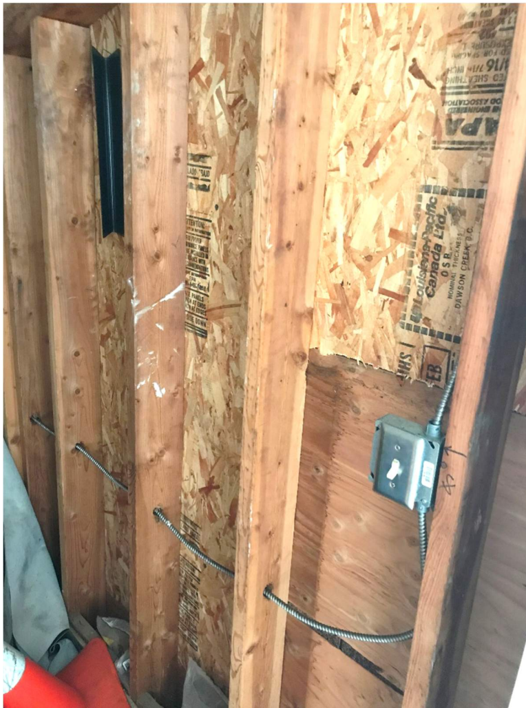
Figure 1-9. Visible Wooden Shear Walls in Storage Closet