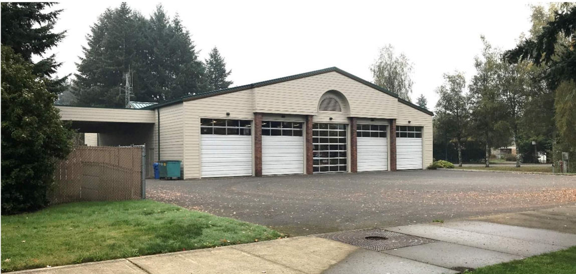
Figure 1-10. Vehicle Bay Exterior