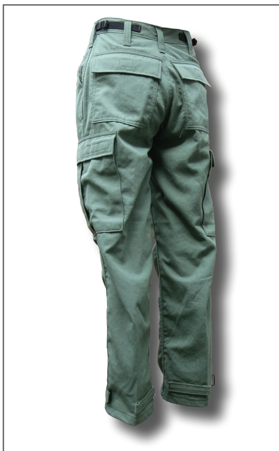
Figure 2—Legacy, unisex, battle dress uniform style pants.