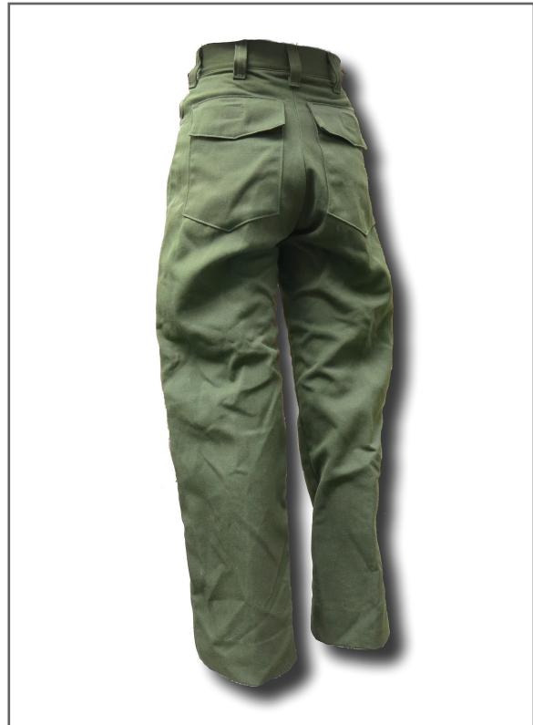
Figure 1 — Previous women-specific wildland firefighter pants.