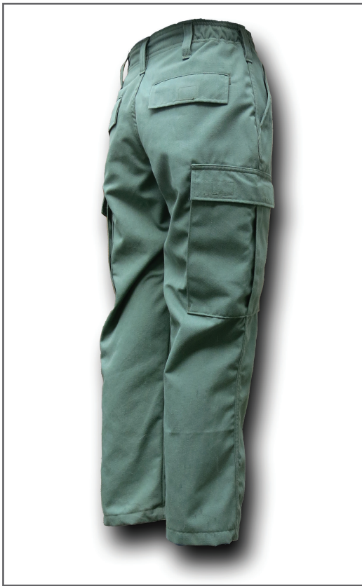
Figure 3—Reintroduced women-specific wildland firefighter pants prototype based on the women-specific army combat uniform.

NTDP equipment specialists reviewed wear test evaluation results, and in January 2021, the Forest Service, Washington Office, Fire and Aviation Management program approved moving forward with developing a new specification based on the ACU-F design. DLA will use the Forest Service specifications for contract manufacturing.