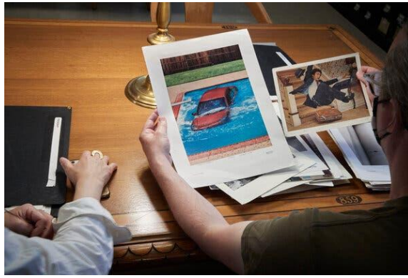
Darin Mickey, a photographer and chair of the creative practices program of the International Center of Photography, browsing the “Accidents” folder of the Picture Collection.