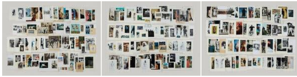
Taryn Simon arranges photographs and images from the folders by hand and then photographs them: “Folder: Rear Views” (2012) is on view at Gagolian. ©Taryn Simon and Gagolian