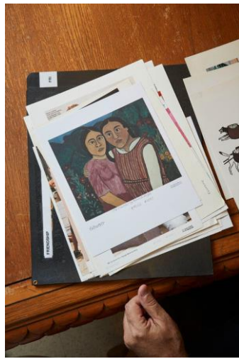
Pictures from the “Friendship” folder.