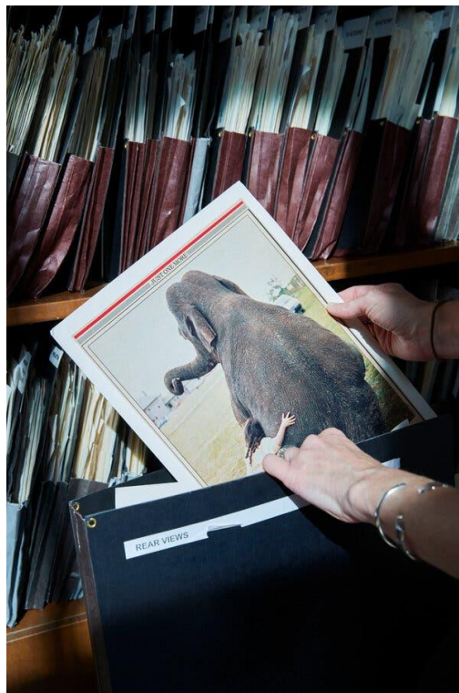
A librarian at the Picture Collection at the New York Public Library examines the “Rear Views” file.

The artist Joseph Cornell once requested a picture of a street urchin with a white cockatoo.