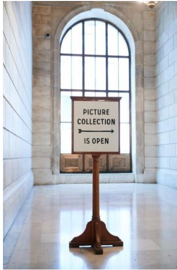
The New York Public Library's Picture Collection, founded in 1915.