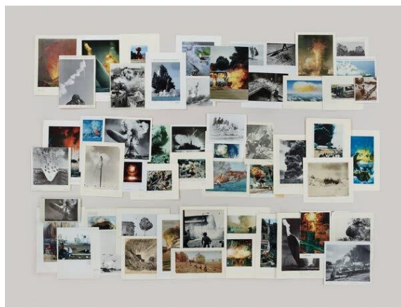
Taryn Simon's photo collage "Folder: Explosions" (2012) at Gagolian. ©Taryn Simon and Gagolian

The fate of the collection may have been sealed in 2017, when it was relocated to the main library from the Mid-Manhattan circulating branch. Going forward, Kelly wants users of the Picture Collection to be more prepared and less spontaneous. “The model that we’re trying to develop is that more information is transparently available online so they can find it before they come to the library,” he said.