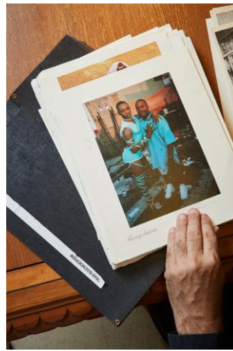
Images from the “Transgenderism” folder on the Picture Collection tables.