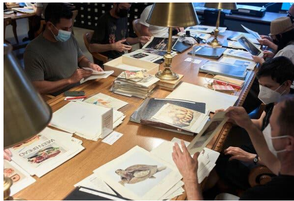
Visitors digging into the files of the New York Public Library's Picture Collection, in the Stephen A. Schwarzman Building. Like the books and periodicals that constitute the bulk of the library's holdings, the image folders will be available to the public only by specific request.

“You see the people go through it and touch it and have the spontaneity of discovery,” said Taryn Simon, the Conceptual artist who has been photographing the Picture Collection’s treasures for nine years, making collages that can currently be seen at Gagosian. “It’s so multidimensional. It just keeps swirling. I think of it as a performance piece or an installation.”