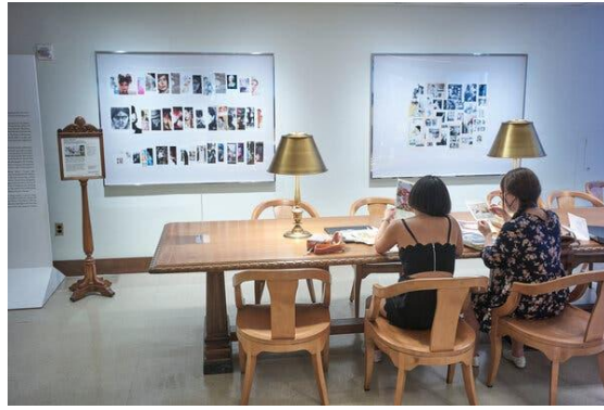
Simon's works hang on the wall of Room 100. They include "Folder: Costume—Veil" (2012) and "Folder: Oxygen" (2012).

Without providing the jolt and tickle of serendipity, however, the Picture Collection will be drained of its élan. Simon, the artist, said her own experience with the collection — characterized by “false finishes and evolving and changing” — opened doors to the unexpected.