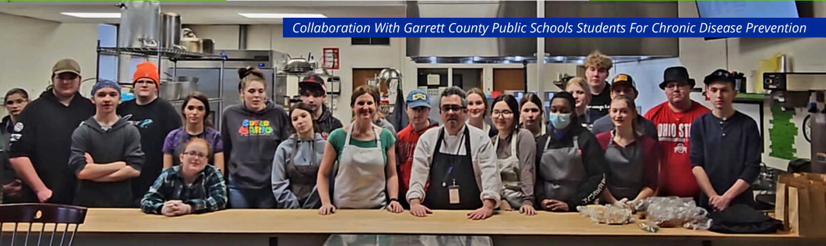
Collaboration With Garrett County Public Schools Students For Chronic Disease Prevention