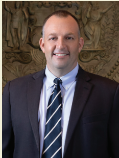
Governor Josh Green, M.D.