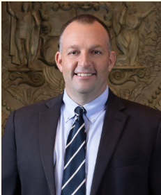
Governor Josh Green, M.D.

Since the end of the legislative session in early May, we have signed more than 80 bills into law that work to create safer communities, increase opportunities for educational equity and diversity, restore faith in government, increase housing opportunities and access to health care, protect our environment and natural resources, and improve the overall quality of life for the people of Hawai'i.