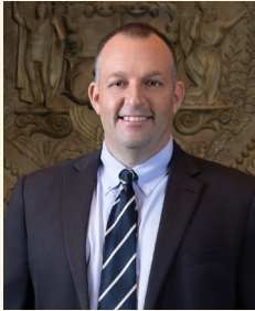
Governor Josh Green, M.D.

We began a phased reopening of West Maui on October 8, in conjunction with the County of Maui. While some expressed concerns about the reopening occurring too soon, there were also many who were asking us to help them recover, and recovery required a gentle approach to reopening that could not be delayed.