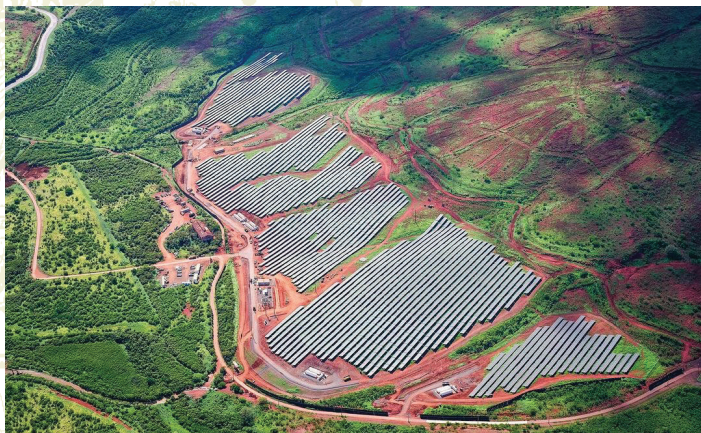
Above: Plus Power's Kapolei Energy Storage System in West O'ahu, operated by Hawaiian Electric, powers 17% of O'ahu's peak load, helping to balance the island's power grid and enabling the continued growth of rooftop solar and utility-scale renewable energy.