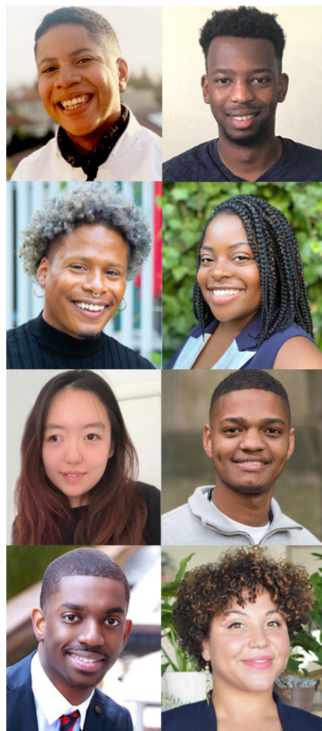
2020-21 Diversity and Community Fellows

The Fellows will interact in their roles with numerous faculty, graduate and undergraduate students in each department creating community for 10,000 – 50,000 diverse students and faculty.