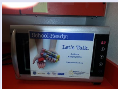
Figure 2. Temperature Controlled Unit with Identifying Signage

how to present the protocol to UAPs utilizing the original Tier 2 training and a newly developed Tier 4 training that discussed the protocol changes and required documentation after administration of stock epinephrine. School nurses work a 9-month contract. Thus, arrangements were made to allow school nurses to work extra duty days to provide the needed training sessions. At least two employees from each summer site were required to attend the trainings before the site opened. Fifteen trainings were required in order to facilitate the number of trainees. The size of each 2-hour training session was limited to 50, allowing for the hands-on training required for administration of an auto-injector pen. A ratio of 10:1 was maintained for this training. UAPs who had previously received training in Tier 2 received a shorter training (1 hour in length) in the recognition of anaphylaxis in unknown individuals, appropriate response, and required documentation after administration of epinephrine. In all, approximately 600 personnel were trained in the new protocol before the start of the 2013-2014 school year.