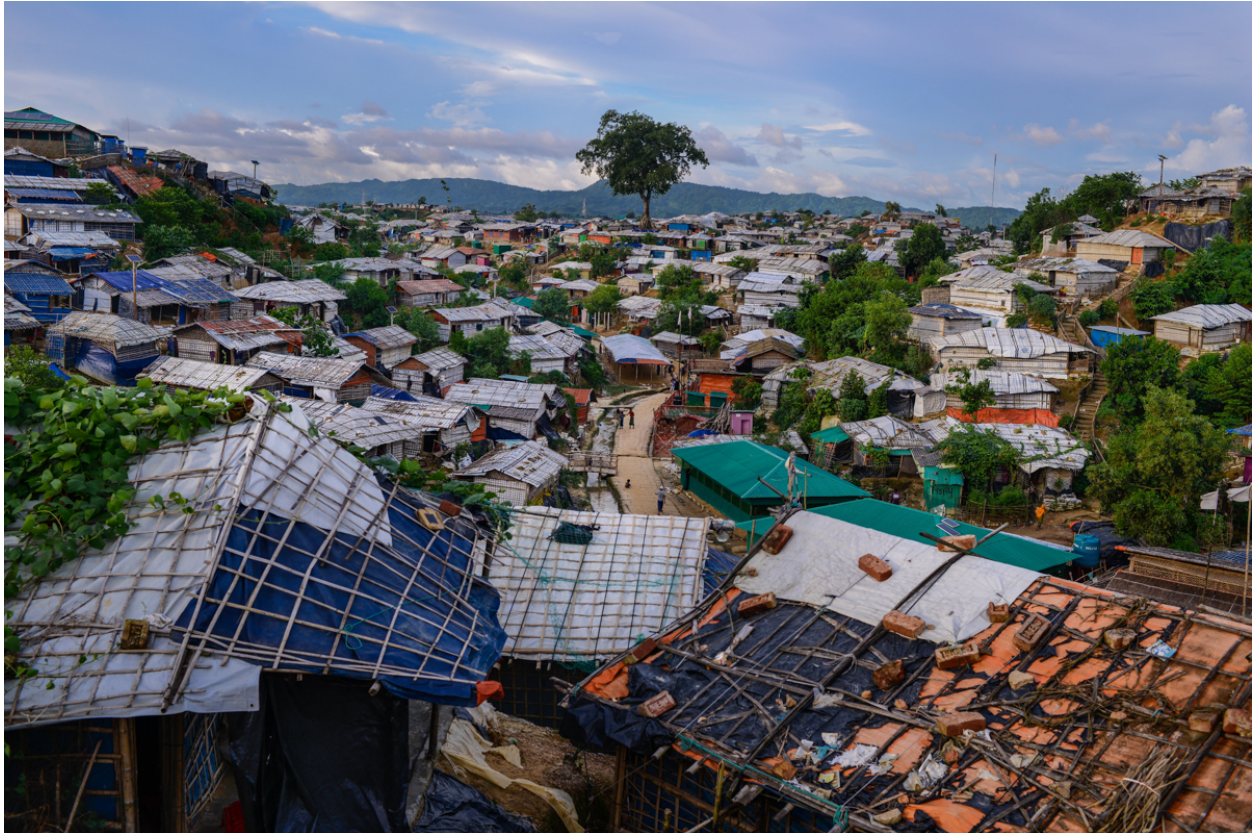
Balukhali Rohingya refugee camp.