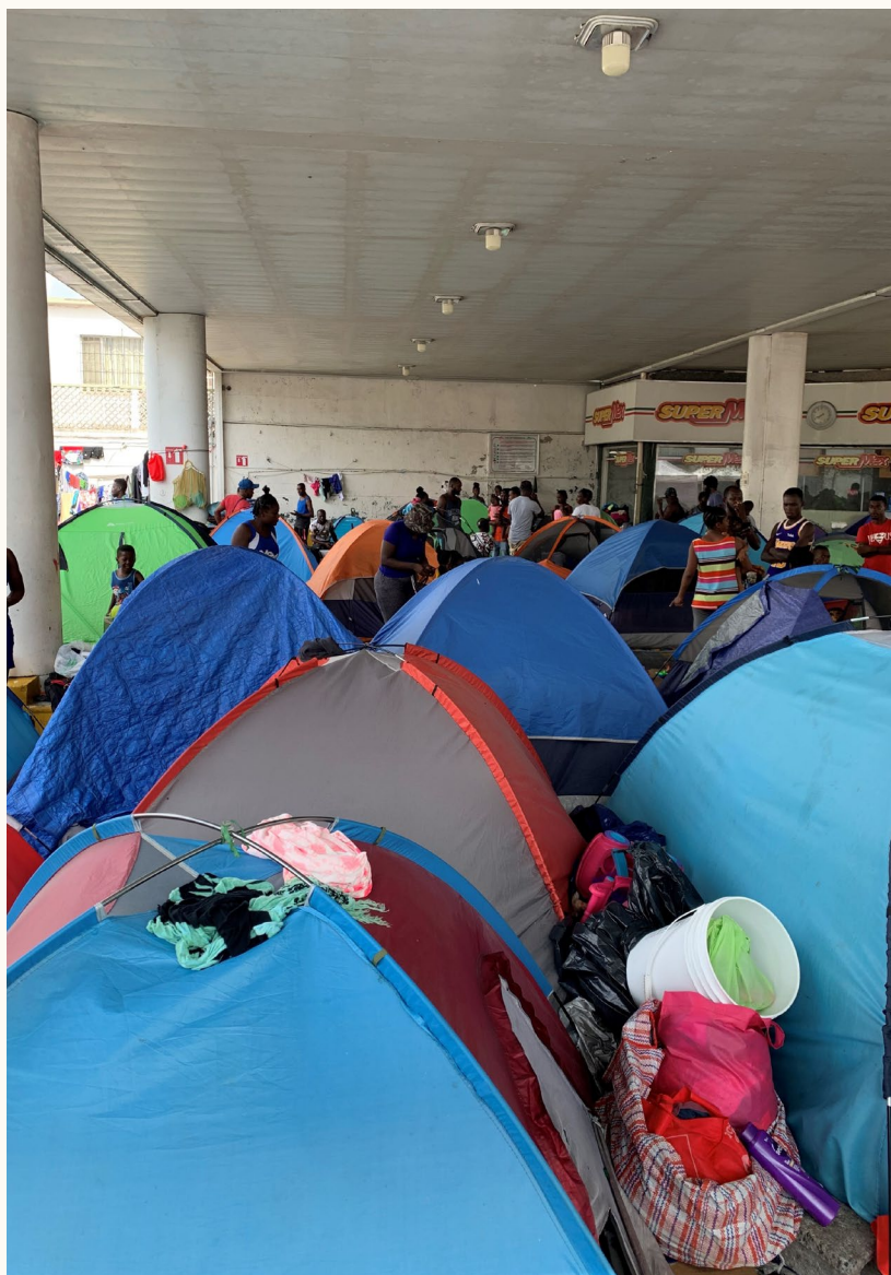
Haitian camp in Matamoros, Mexico, June 2023.

Non-Mexicans presenting at ports of entry without a CBP One appointment who are subject to the asylum ban can later try to overcome the ban and be considered for asylum if they can prove that they (or a member of their family who they are traveling with) faced an “exceptionally compelling” circumstance, such as at the time of entry into the United States, faced an acute medical emergency; an imminent and extreme threat to life or safety, such as an imminent threat of rape, kidnapping, torture, or murder; or was a “victim of a severe form of trafficking in persons,” as defined by U.S. regulations.