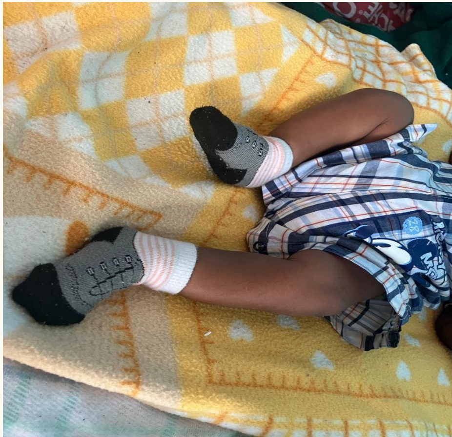
A sick Haitian one-month-old baby living in Haitian camp in Matamoros, June 2023.