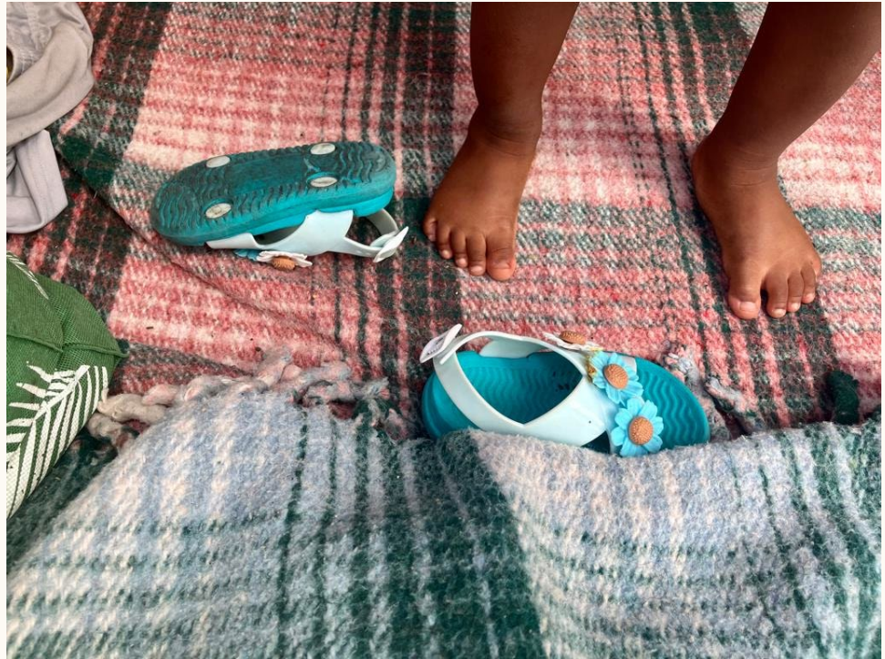
Young Haitian child living in a tent in a camp in Matamoros, Mexico, June 2023.