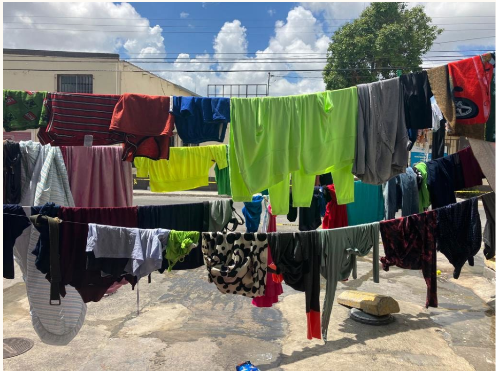
Clothes dry at the Haitian camp in Matamoros, Mexico.

and described how they have to come up with money to buy internet data and has had to beg for money to pay for internet data.