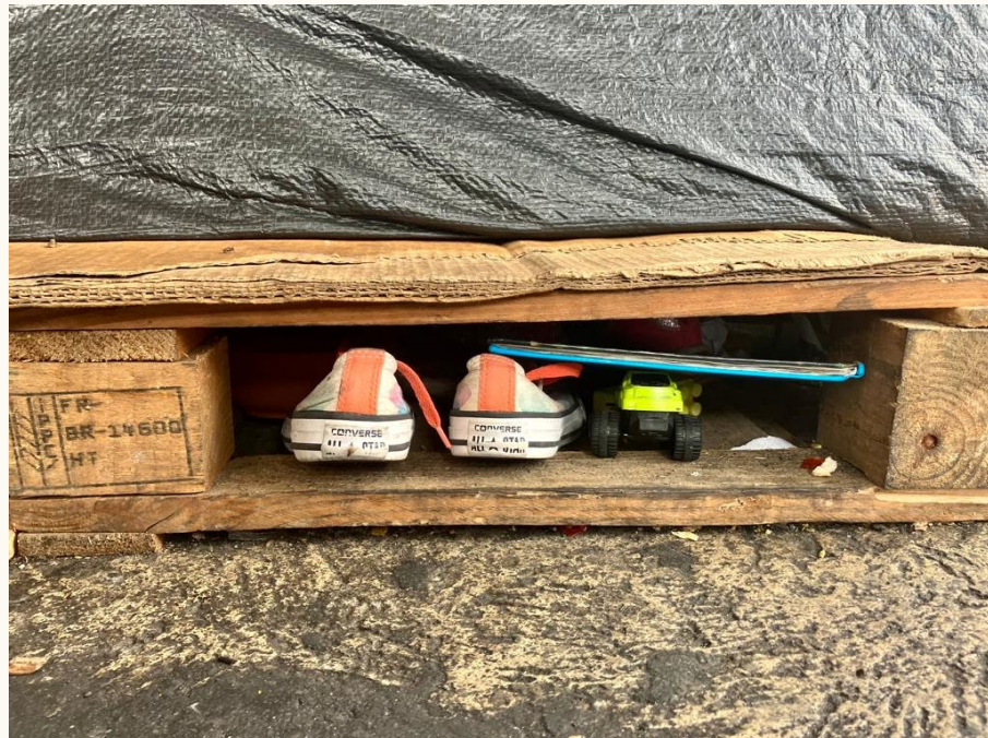
A child's shoes and toys are stored

Humanitarian workers in Mexico informed Human Rights First that the dire life-threatening situations facing asylum seekers and their needs for immediate safety drive their decisions, rather than the existence of the asylum ban rule.