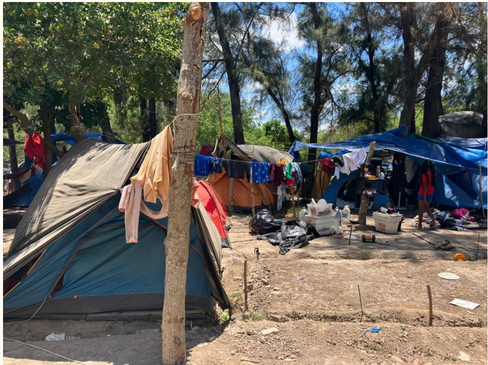
Makeshift tents in the Matamoros encampment, June 2023.

Many people waiting in Mexico to seek asylum are living in makeshift encampments with none of the necessary safeguards or systems in place to protect women, children, LGBTQ+, and other vulnerable people from being targets of abuse and violence. Local aid workers report instances of the cartel terrorizing the Matamoros camp in June 2023 as well as individuals and families facing heightened risk of kidnapping, rape, and other violent harm in the encampments and outside shelters in Reynosa.