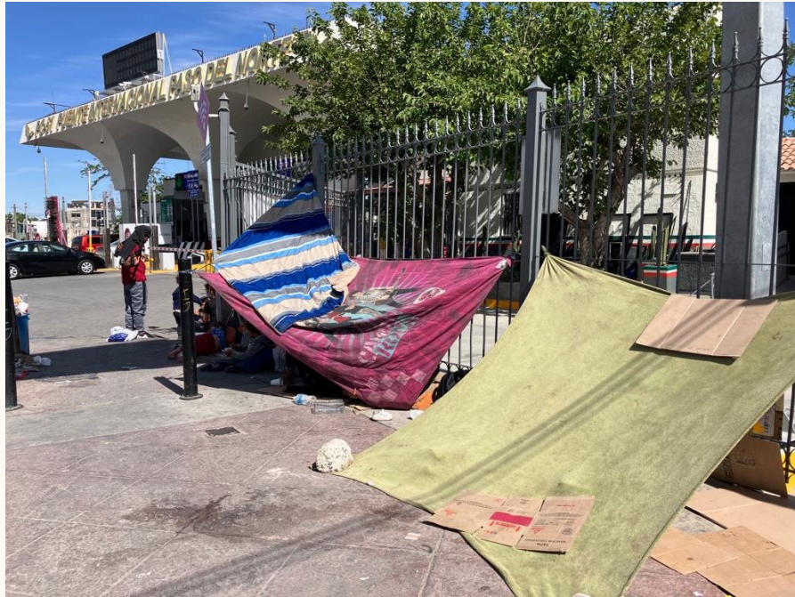
Families wait to seek asylum on cardboard under improvised shelter outside the Juarez Paso del Norte Port of Entry, June 2023.