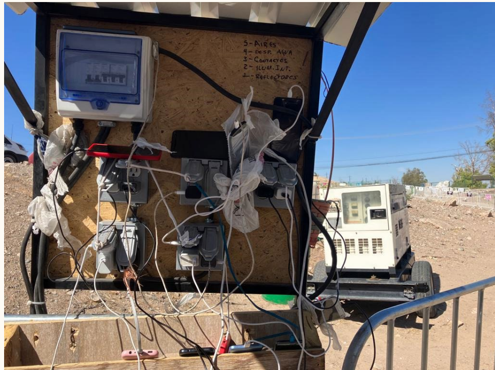
Asylum seekers charge their phones outside a temporary tent shelter in Juarez that has since been closed down.

In Matamoros and Reynosa, thousands of people waiting to seek asylum live in informal encampments, unable to afford a room to rent, medical care or food and water, let alone internet and electricity and yet must come up with about $200 Mexican pesos (nearly $12 USD) a week, on average, for internet data alone for months on end just to obtain a CBP One appointment to present at the port of entry to seek asylum.