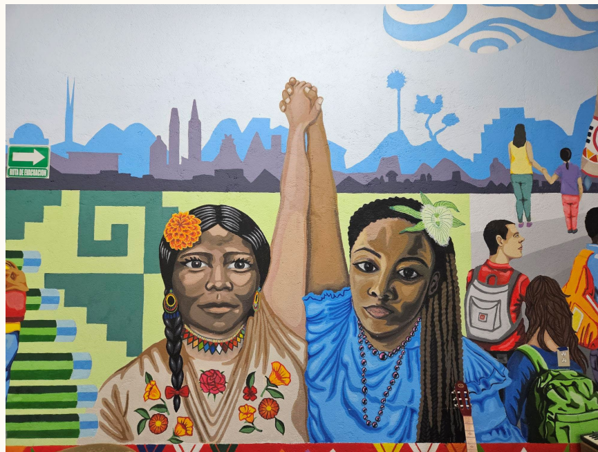
Mural inside a shelter in Tijuana, Mexico, July 2023.

The asylum ban endangers Black, Indigenous, LGBTQ+ and other asylum seekers by making them wait in places where they face additional risks and denying equitable access to asylum by punishing those who do not have CBP One appointments or cannot safely wait for weeks or months for an appointment. The asylum ban also punishes Black, LGBTQ+ and other refugees for not seeking asylum in countries where they will not be safe, as outlined later in this report.