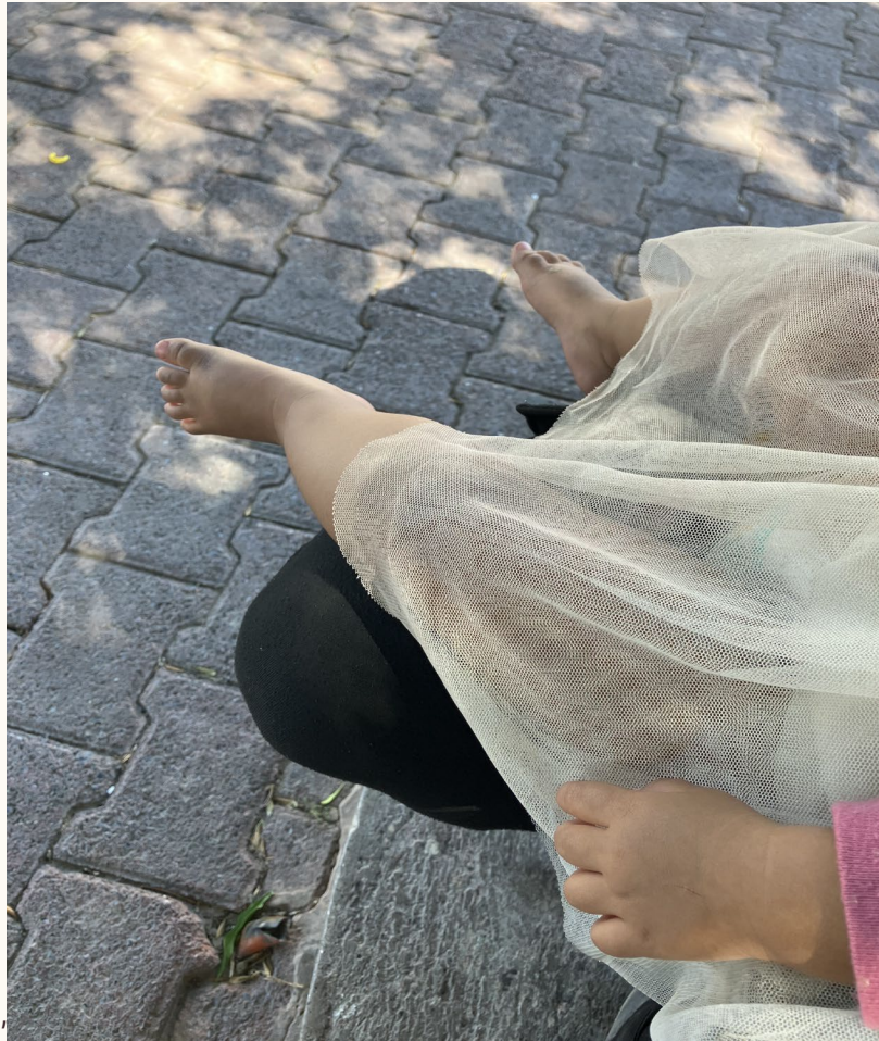
One-year-old child living on the street with her sister, mother, and aunt who were turned away by CBP at Matamoros Port of Entry.