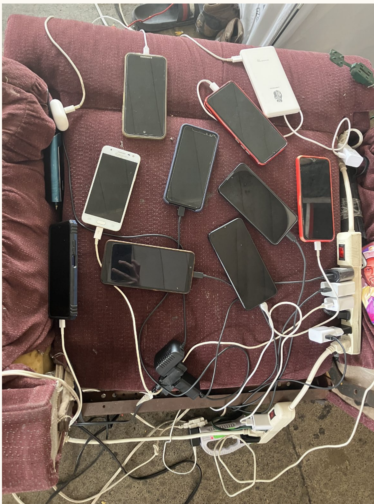
Phones charging inside the Haitian camp in Matamoros, Mexico.

In addition, the asylum ban disparately harms many Black asylum seekers by imposing penalties on those who do not have CBP One appointments when the app is not even available in the languages spoken by many African and other Black asylum seekers and continues in some cases, despite improvements, to fail to recognize darker skin tones.