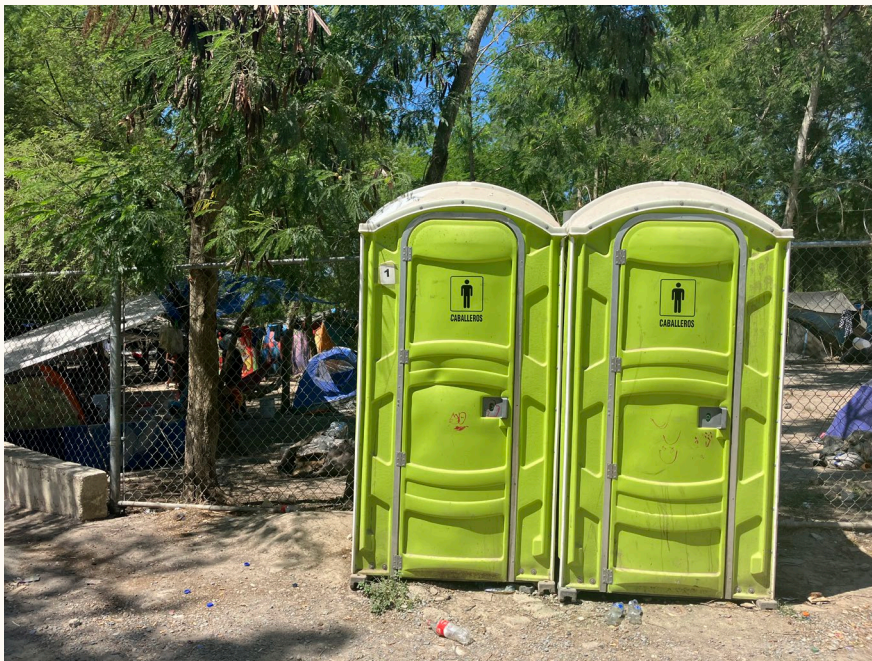
Matamoros encampment, June 2023.