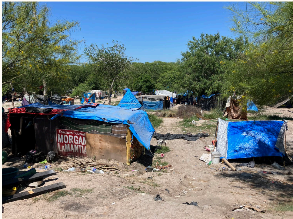
A makeshift camp where asylum seekers wait in Matamoros, Mexico near the border with Brownsville, Texas.

Human Rights First witnessed abysmal conditions in open-air encampments along the edge of the Rio Grande in both Matamoros and Reynosa, Tamaulipas, where thousands of women, men, and children were living in makeshift tents made of blankets and garbage bags, lacking minimum Sphere humanitarian standards of shelter, water, sanitation and hygiene, nutrition, and health services. As the Haitian Bridge delegation reported, there are piles of garbage, burn pits to deal with waste, limited numbers of porta-potties, and a dangerous lack of sanitation and clean water which can present a risk of cholera.