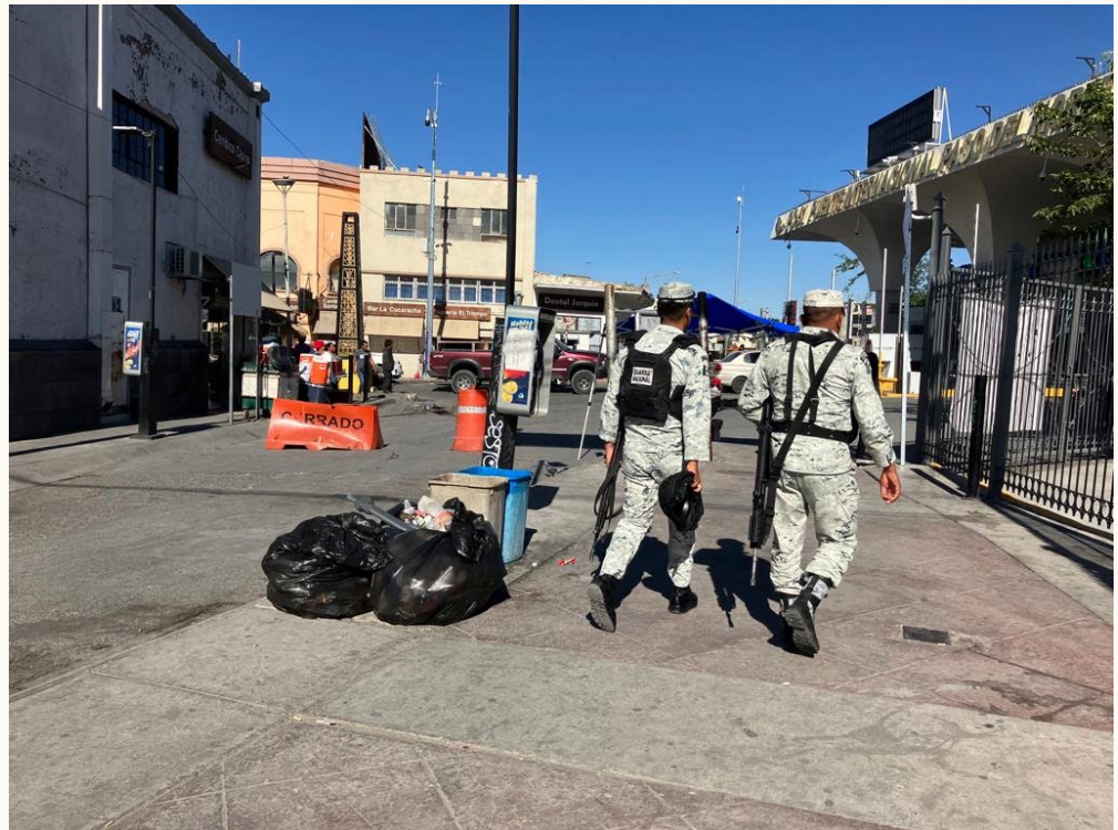
Members of the Mexican National Guard patrol the Paso del Norte Port of Entry in Juarez, Mexico, June 2023.

Abuses ranged from discriminatory and arbitrary detention, intimidation, robbery, extortion, sexual assault, and enforced disappearance through collusion with organized criminal groups by turning migrants and people seeking asylum over to them for kidnapping and ransom.