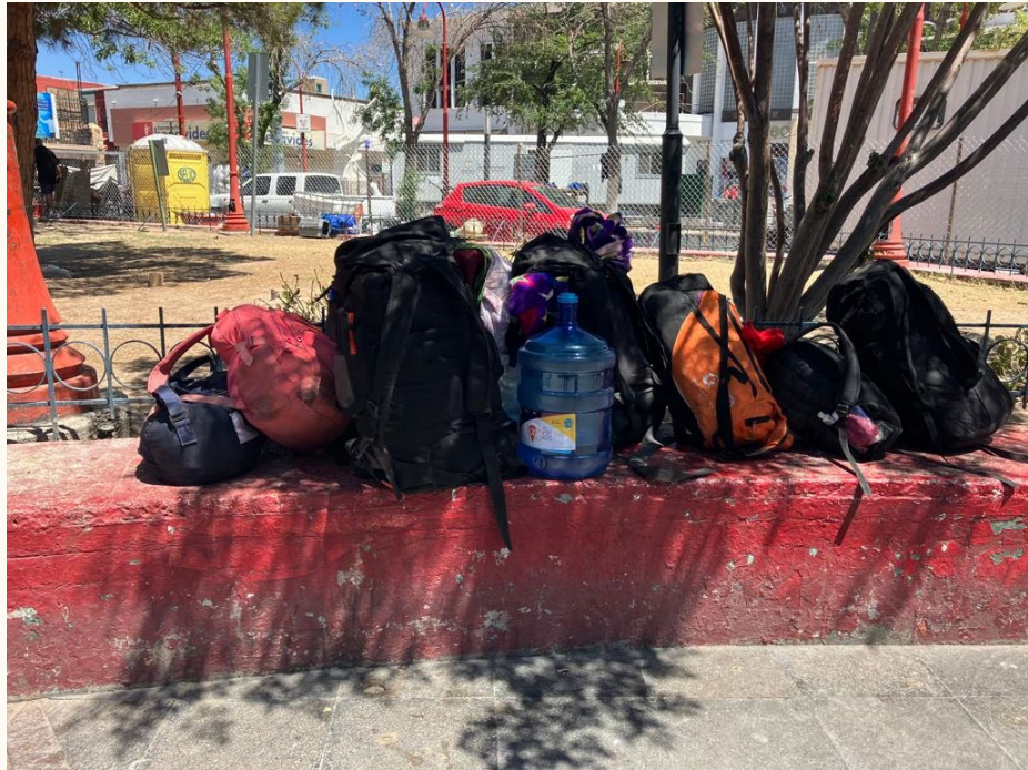
Belongings of families waiting to seek U.S. asylum in Juarez, Mexico, June 2023.

immigration officers'] cars. We're threatened that if we don't pay them, they'll deport us. We're charged anywhere from 50 to 500 pesos. Because of this, we've had to walk a lot to avoid the bus."