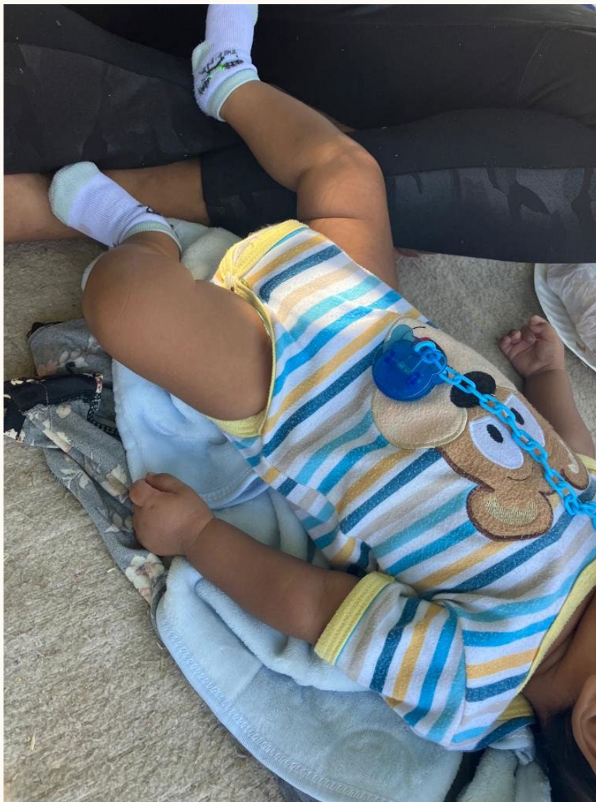
Two-month-old infant sleeps with mother and three-year-old sister waiting to seek asylum outside the Juarez Port of Entry.