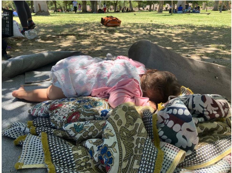
Infant sleeps near the Juarez Bridge of the Americas Port of Entry where her family has been waiting for five days.