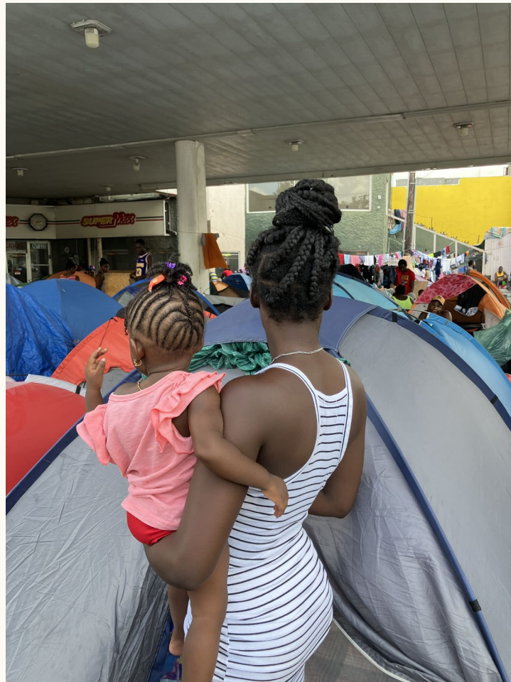
Haitian mother and child wait for a CBP One appointment