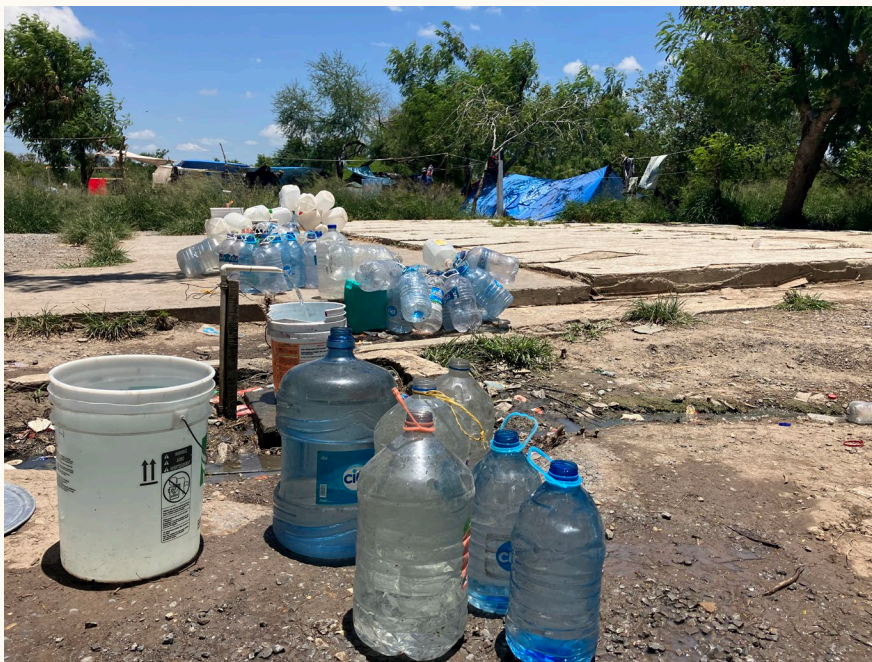
Matamoros encampment, June 2023.