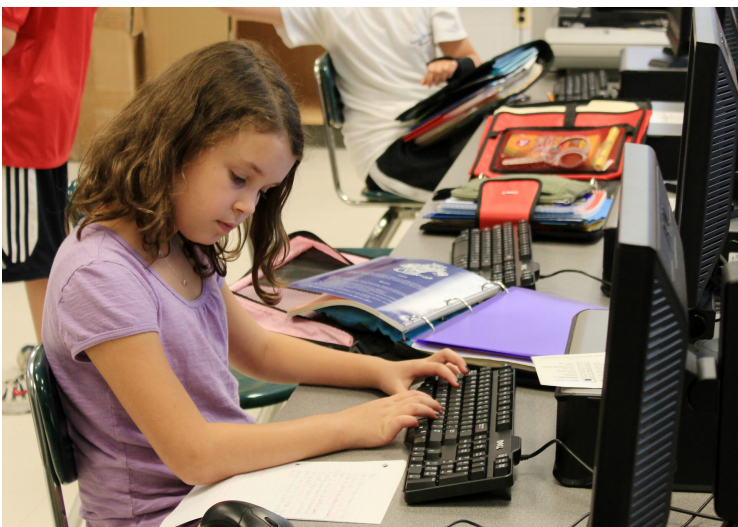
Maryland Elementary School Student in Computer Lab

The Interagency Commission on School Construction has updated their primary email address. Please utilize iac.pscp@maryland.gov as the primary source of communication with the IAC. All correspondence to the previous email iac.msde@maryland.gov is being forwarded. Thank you.