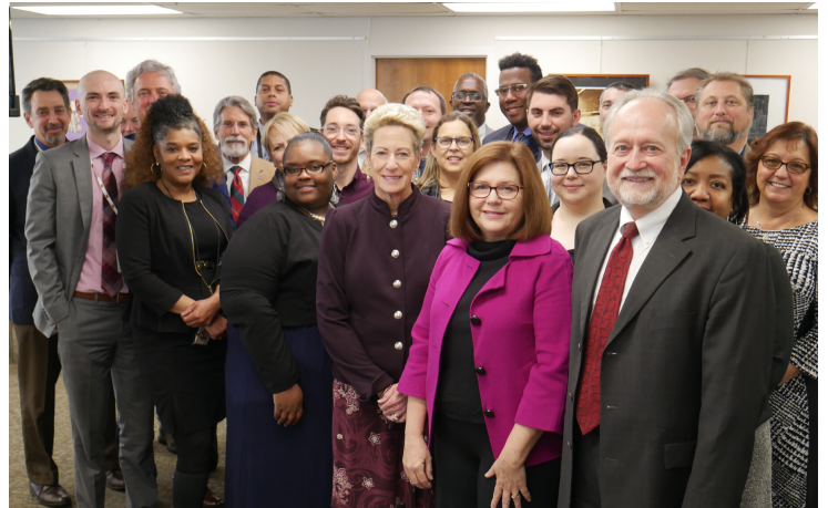
IAC Members and Staff

The Interagency Commission on School Construction is currently hiring! Please check our website's home page at iac.maryland.gov to view listings for regional facilities managers, financial managers, administrators, and more.