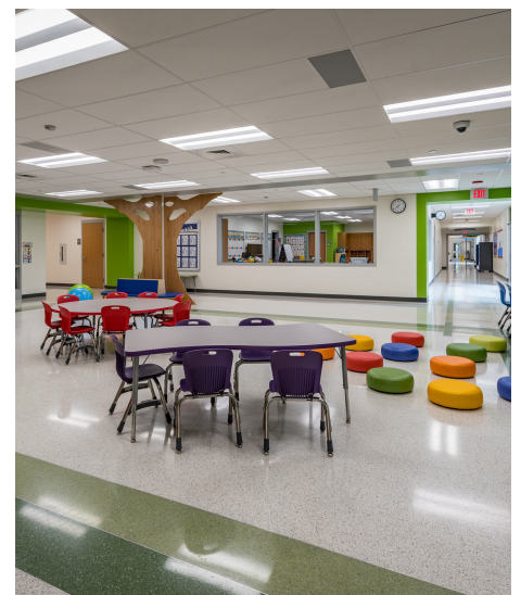
Samuel A. Mudd Elementary Collaborative Space