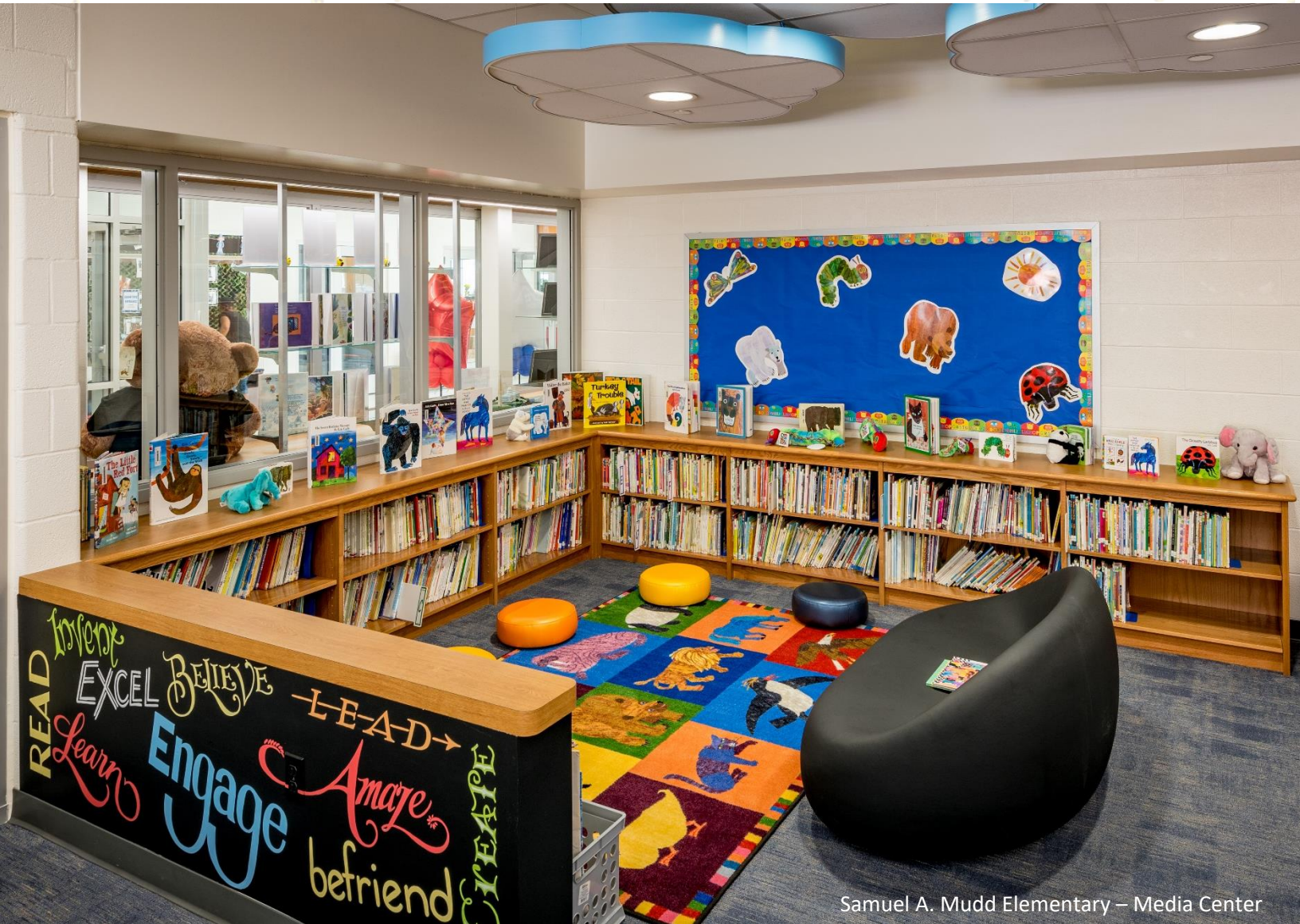
Samuel A. Mudd Elementary – Media Center