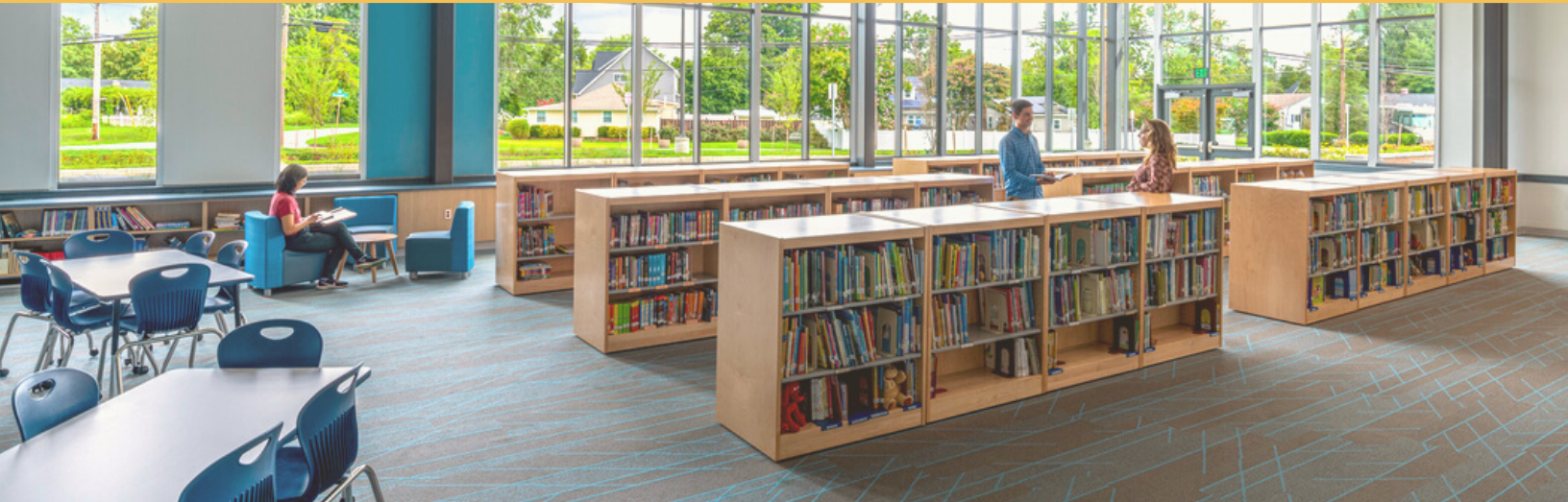
Edgewater Elementary