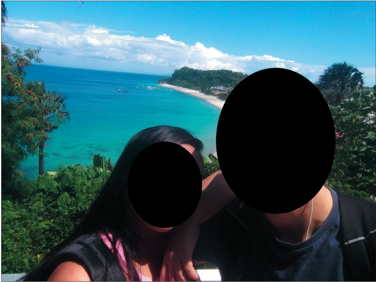
Image 7: JStark at White Beach, Mindoro, Philippines, unknown date