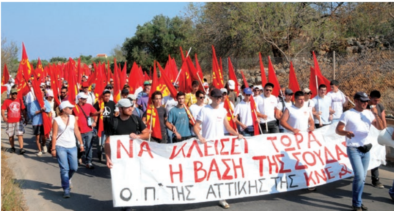
22 nd Two-Days Antiimperialist Camp of KNE in the island of Crete. During the event a large mobilization outside the air and naval military base took place. These military bases serve the imperialist wars that are waged in the region of Eastern Mediterranean and Middle East.