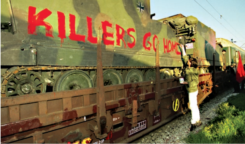
Highlight of the mobilizations against the NATO intervention in Yugoslavia on 1999.