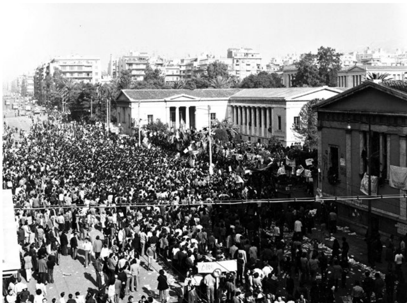
The occupation of Law School and the Uprising of the Polytechnic School, on February and November of 1973 respectively, they constituted the climax of the struggle against the military dictatorship of 1967 - 1974.