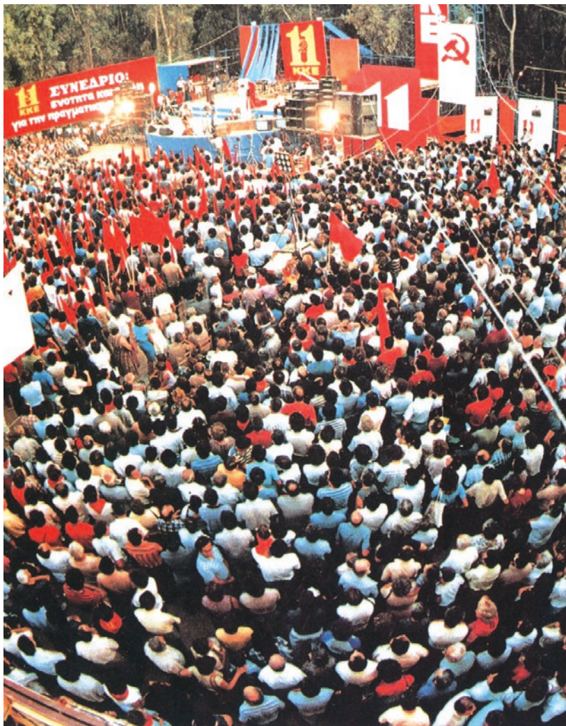
The 8 th Festival of KNE - Odigitis on 1982, in Peristeri, a working class suburb of Athens.