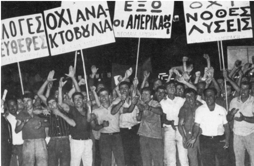
From the large mobilizations, where the youth participated in massively, on July 1965.