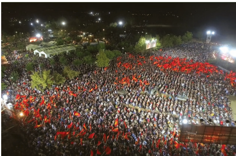
From the Central Political Events of the 43 rd Festival of KNE - Odigitis in Athens.