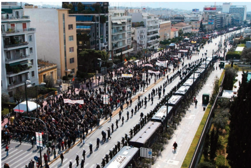
From the mobilizations outside the US Embassy in Athens, against the imperialist intervention of USA - NATO in Iraq, on 2003.