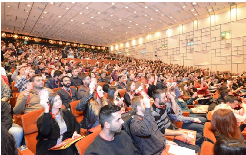
From the works of the 11 th Congress of KNE (18-21/12/2014).