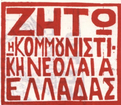
Printed material of KNE from the clandestine period of its action.