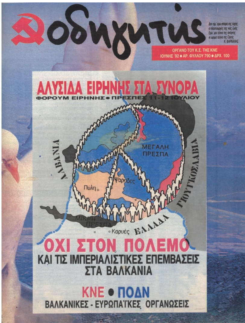
The frontpage of "Odigitis" dedicated to the 1 st Two-Day Antiimperialist Camp of KNE, that took place in the common borders of Greece, Albania and Yugoslavia. In this event were also invited many Communist Youth Organizations from the Region of Balkans and Europe.