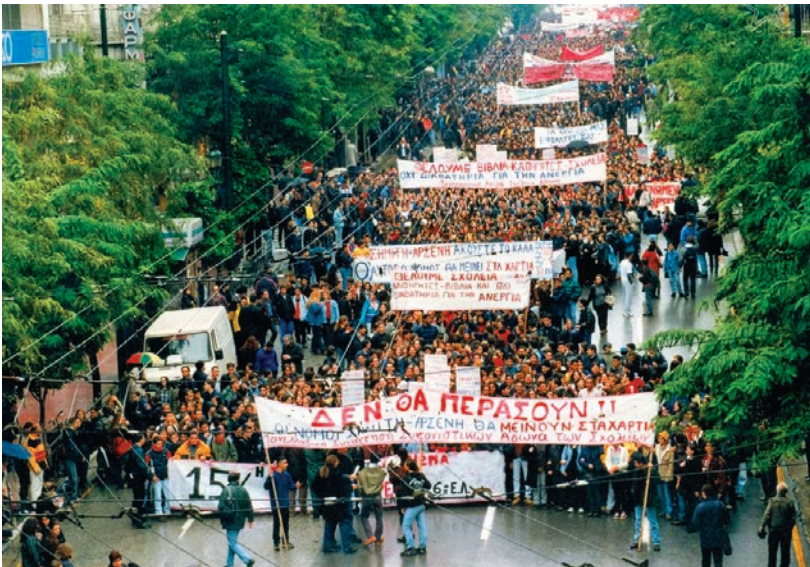
From the large mobilizations of school-students on 1998.