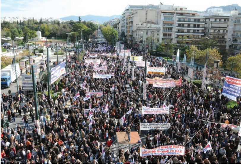
From the 1 st workers' strike after the outbreak of the capitalist crisis in Greece, on December 17, 2009.