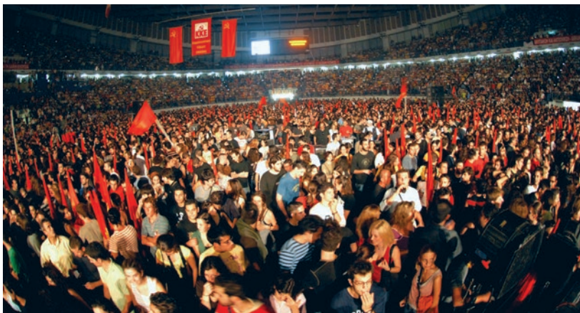
From the Central Events of the 33rd Festival of KNE - Odigitis (2007). The earnings were offered as an aid to the young victims of the fires that burst during the summer of that year.