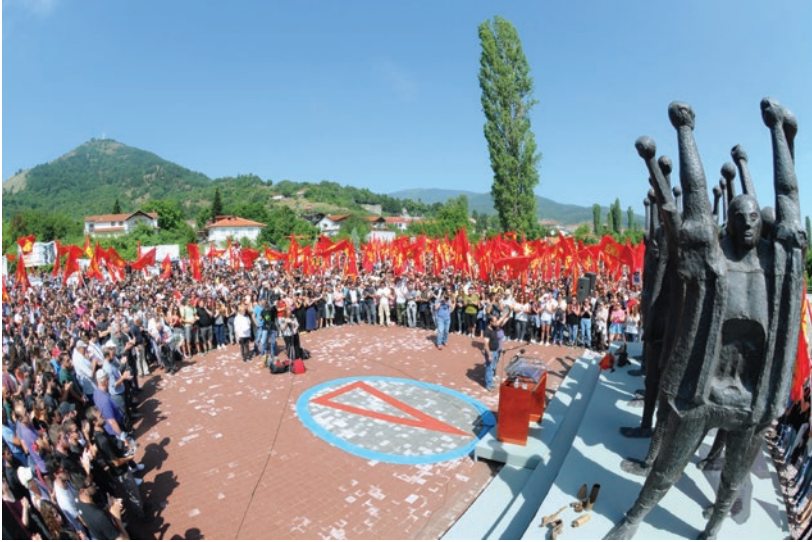
Central Political Event of the 25th Two-Days Antiimperialist Camp of KNE in the city of Florina - Northern Greece, July 2016.