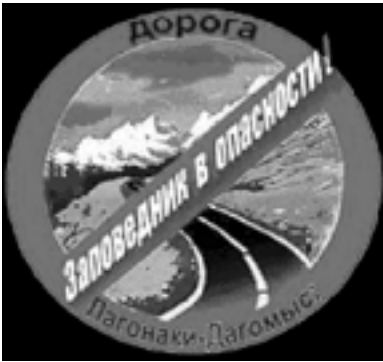
The zapovednik is in danger! Anti-road campaign logo*