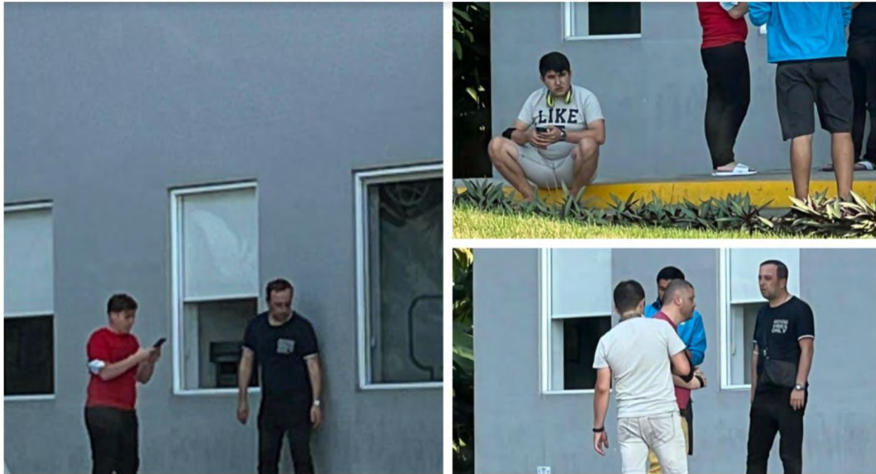
Uzbek migrants in Tapachula, Mexico after crossing from Guatemala on their way to the US southern border. January 2022