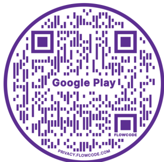
GOOGLE PLAY STORE