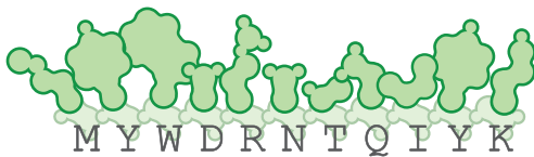
HLA-B, partial amino acid sequence (11 of 362 total)

We are constantly being exposed to pathogens and toxins. To respond to new threats, it is advantageous to the population if our HLA-B proteins can bind to and present a wide variety of peptide flags.