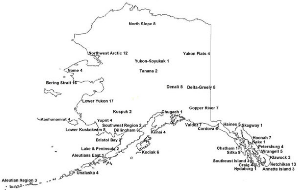
Number of SESA LID Students in School Districts

SESA assists school districts in providing special education services to students including, but not limited to: