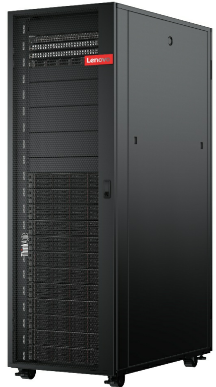
Cloud-optimized ThinkSystem SR650 servers, factory-installed in a rack with NVIDIA Mellanox networking, form the foundation of the Lenovo ThinkAgile SXM.

The ThinkAgile SXM solution allows you to budget more accurately for IT expenses, better deliver on service-level agreement commitments, and ultimately generate greater end-user satisfaction.