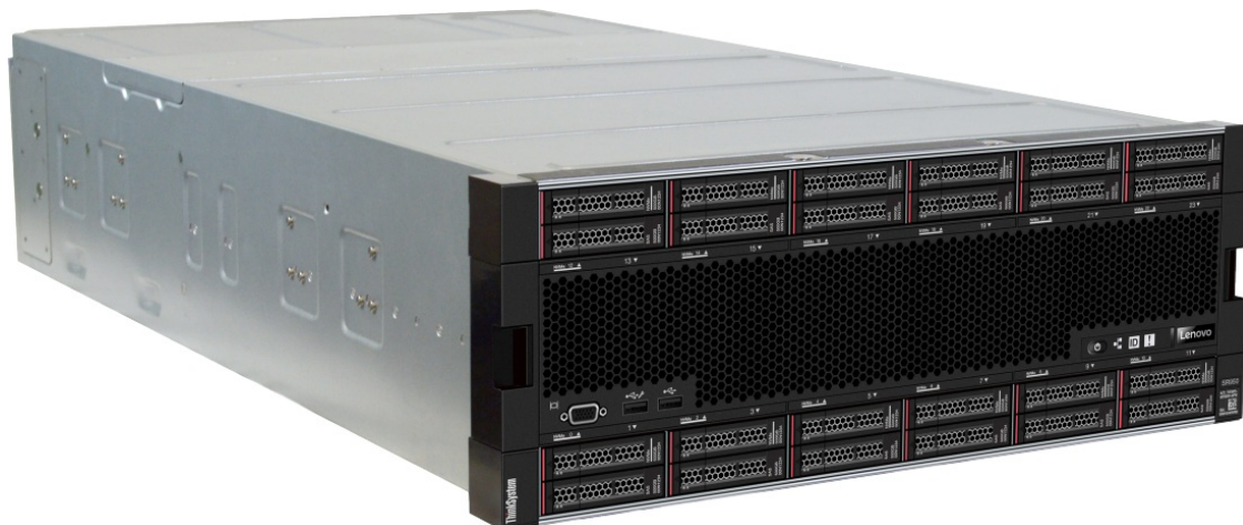
Figure 1. Lenovo ThinkSystem SR950

121 World Records: The 77 World Records set by the SR950 server listed in this article are a subset of the overall Lenovo 121 World Records as documented in article Lenovo Servers: 121 World Record Performance Benchmarks .