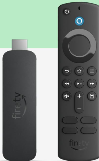
Figures apply to Fire TV Stick 4K - 2nd Gen only, not including bundle accessories

Built to last. But when you're ready, you can trade-in or recycle your devices. Explore Amazon Second Chance .