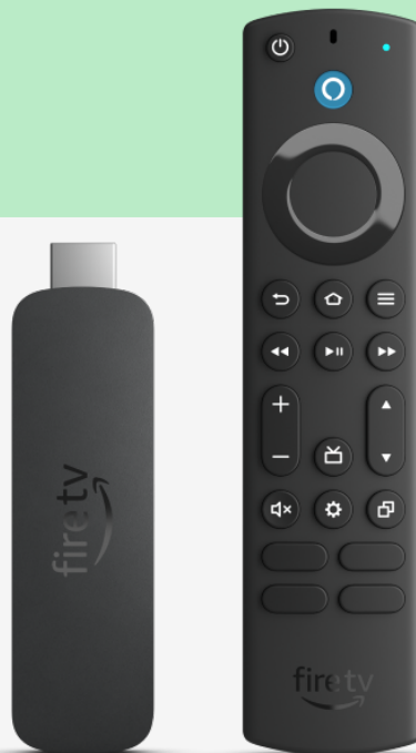
Figures apply to FireTV Stick 4K Max - 2nd Gen only, not including bundle accessories

Built to last. But when you're ready, you can trade-in or recycle your devices. Explore Amazon Second Chance.