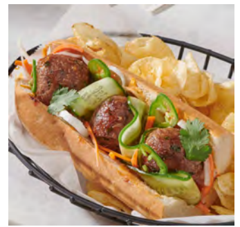
Bahn Mi Meatball Sub

Item #: GR31010 GTIN: 1-08-60008-52968-5 Case Pack: 12 - 1 lb. bricks