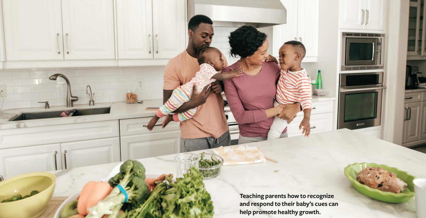
Teaching parents how to recognize and respond to their baby's cues can help promote healthy growth.