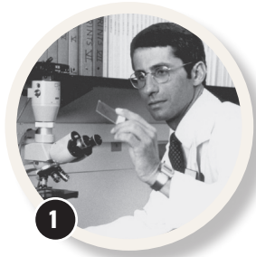
Section Head, LCI Clinical Physiology