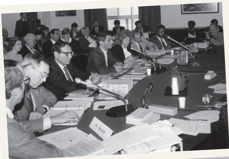
Dr. Anthony Fauci testifying at a U.S. House Appropriations hearing, 1987.