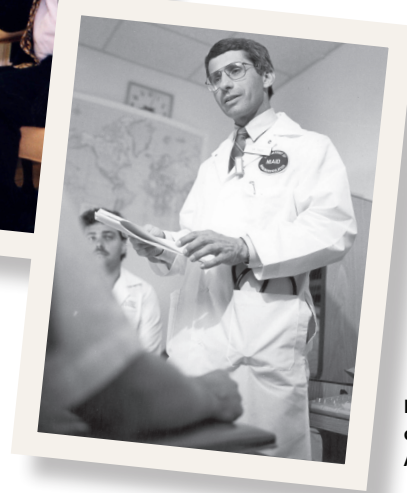
Dr. Anthony Fauci consulting with an AIDS patient, 1987.