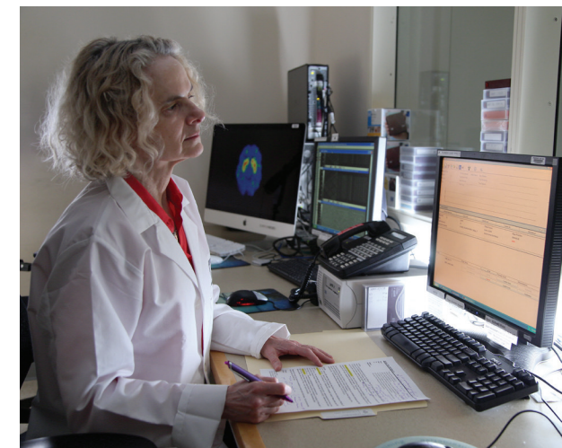
Dr. Nora Volkow, a pioneer in addiction science, uses brain imaging to study how substance use affects the brain.

And we're very involved in policy and translational research so we can bring interventions into different communities . How do we learn from what other diverse groups are doing to address this crisis in their communities? What works well? What doesn't?