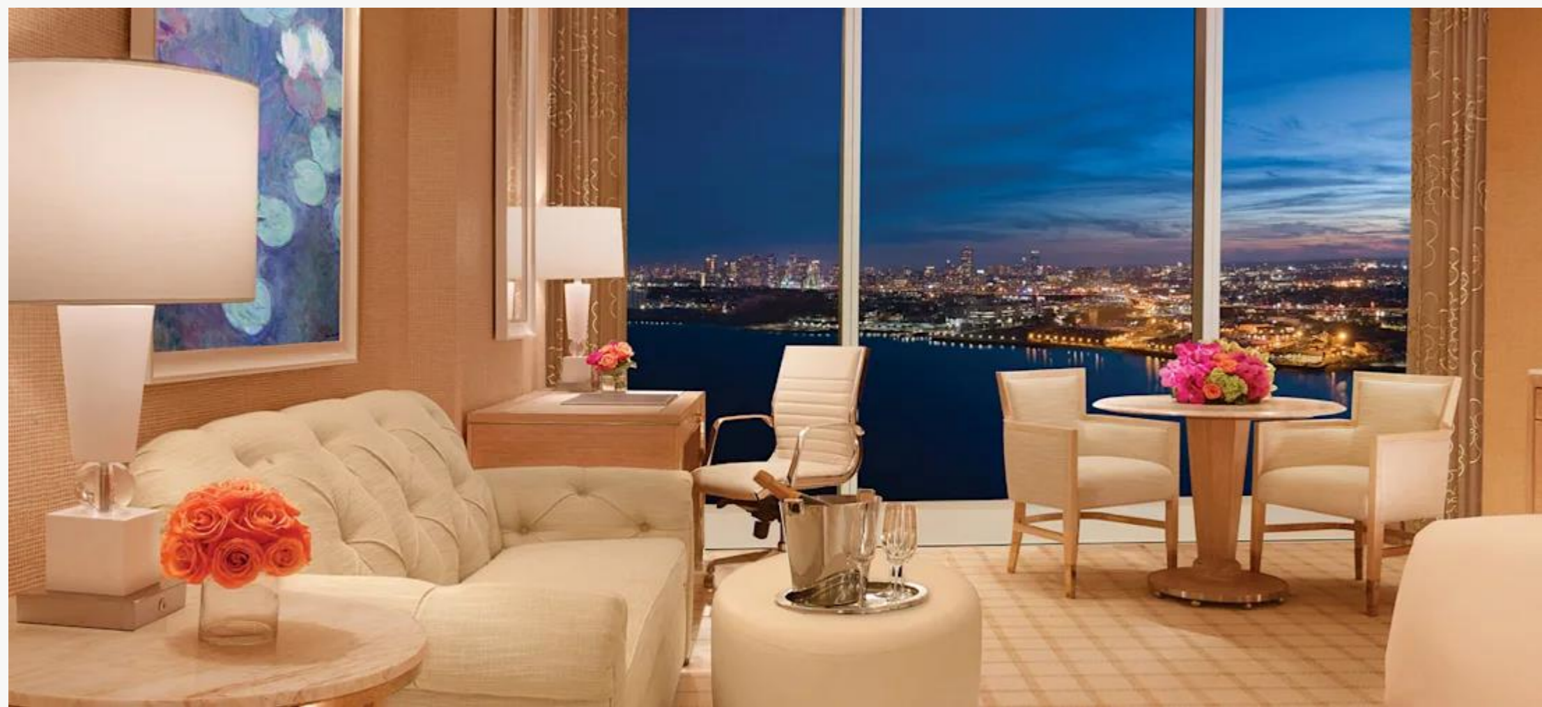
September 1, 2021