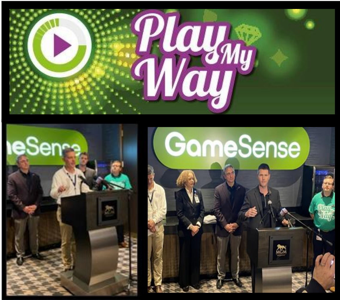
March 31, 2022: PlayMyWay Official Launch