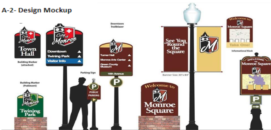
ATTACHMENT A-2- Design Mockup

This section of the application should include any relevant materials including scopes, diagrams, and any bids. Please make sure to label any attachments.