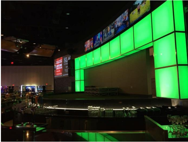
1776 Revolution Lounge