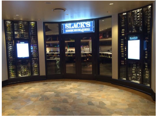
Slack's Oyster House & Grill