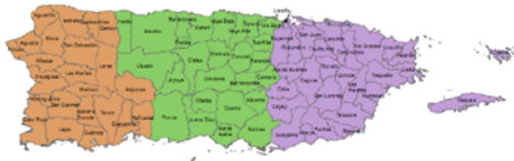
Regiones de CoCoRaHS de Puerto Rico Puerto Rico CoCoRaHS Regions