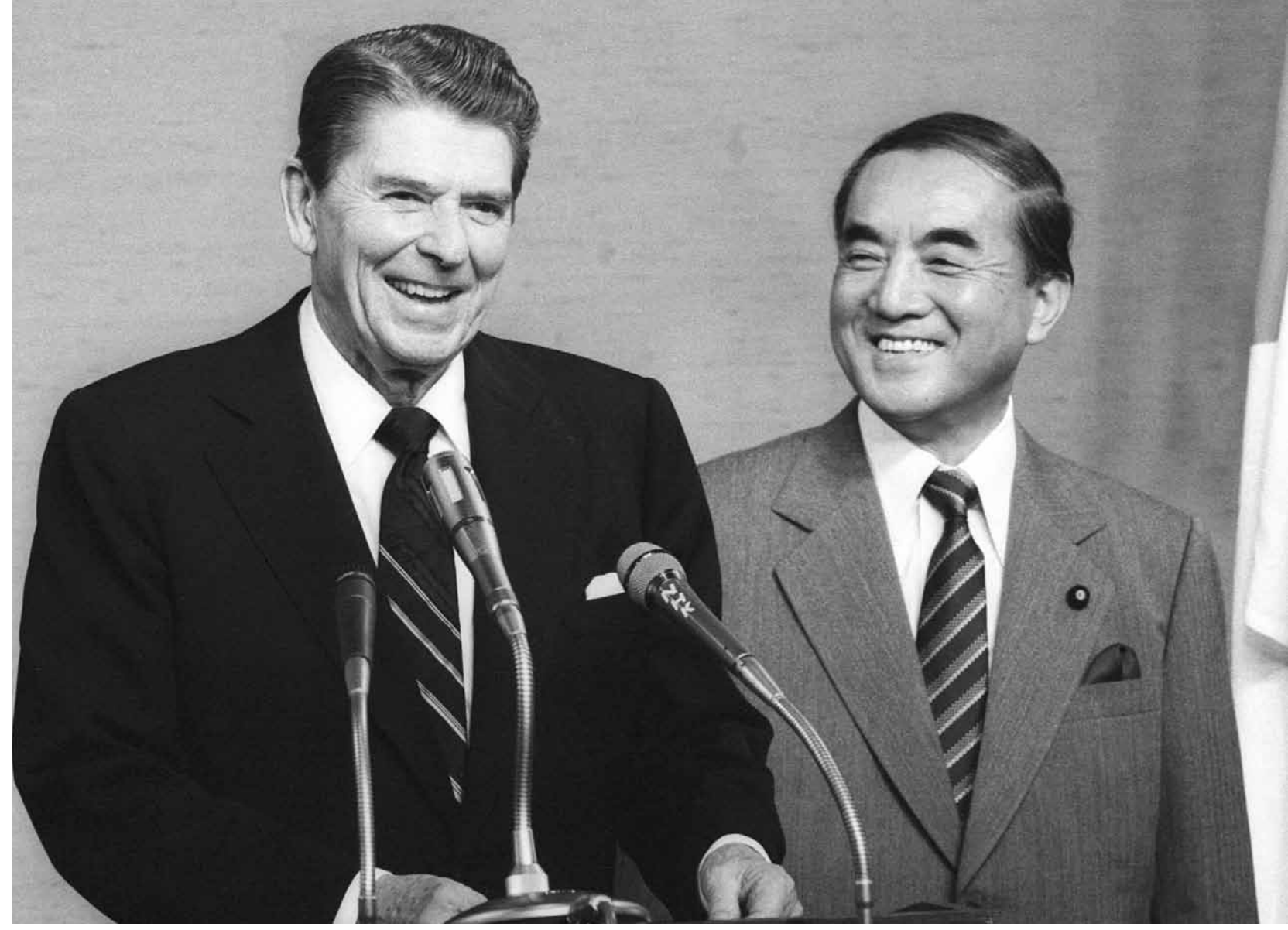
President Reagan and Prime Minister Nakasone

In addition to the realm of technology, Chinese capital is also secretly penetrating into real estate. The discussion on CFIUS has often looked at cases where areas surrounding military bases or airports are being bought up by Chinese capital. In Japan, the government has finally acted to authorize its investigation on the usage of areas neighboring the Ministry of Defense, but there have not been any laws enacted to substantially research or restrict general land acquisition with foreign capital. It is already revealed that Chinese capital bought land around the Japan Self-Defense Forces bases in Hokkaido and Korean capital did the same in Nagasaki. Moreover, water resources and forests are increasingly being acquired by foreign capital that is mainly Chinese. It has reached at least 14,305 acres, according to research that the