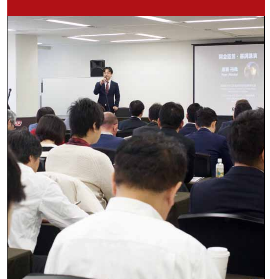
Japan-U.S. Innovation Summit hosted by the Pacific Alliance Institute.